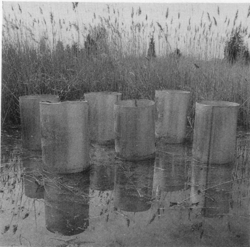
Fig. 2. Test release site in Guilford, Connecticut, showing the placement of the treatment and control steel drums in the salt marsh pool.

in 3.5 liter glass jars containing water from the breeding site. On March 1, copepod densities were determined and infectious meiospores, which had been harvested from field-collected Ae. cantator larvae obtained the previous fall, were added to the jars at a rate of 1.3 \times 10^4 spores/ml or 2.5 \times 10^4 spores/female copepod. Copepods were maintained as described above for 4 weeks. At the end of the exposure period, copepod densities were estimated once again, and the prevalence of infection in adult females was determined from microscopic examination (40 \times ) of whole wet mounts ( n = 25 ). Spore densities were also determined from hemacytometer counts ( n = 5 copepods), and these data were collectively used to calculate the total quantity of spores (no. female copepods/jar ( 3150 ) \times % female copepods infected ( 0.533 ) \times mean no. spores/female copepod ( 1.6 \times 10^5 ) = 2.7 \times 10^8 spores) available for release on April 5.