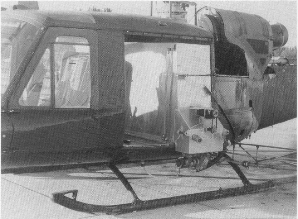
Fig. 2. Bell UH-1 helicopter equipped with aerial spray system.

This equipment is currently operational on a Bell UH-1 helicopter (Fig. 2) and, to date, has proven to be a reliable and effective aerial agitation system for products that are difficult to mix.