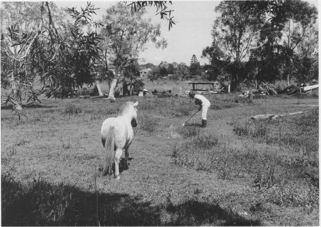
Fig. 2. A typical grassy field in the study area.

that every major breeding site within flight range of the human populations being protected is identified and mosquitoes controlled there. This is where a rapid survey tool is vital.