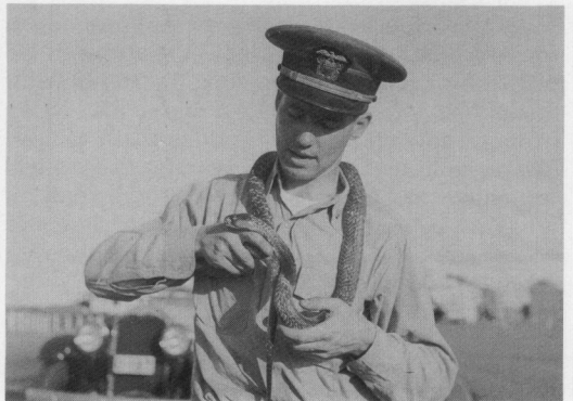
Fig. 3. The back of this photo is inscribed "13 May 1947. This is a live cobra, defanged and depoisoned. Borrowed from a Colombo snake charmer for this picture."

the isolation of Sindbis virus from Culex univittatus mosquitoes (Taylor et al. 1955b), and helped formulate the role of wild birds in the ecology and distribution of West Nile virus (Work et al. 1955, Taylor et al. 1956). By that time Davis (1932) and Bates and Roca-Garcia (1945, 1946) had provided the first evidence for a relationship between temperature and vector