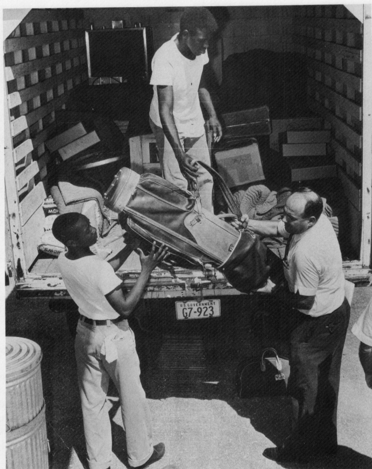
Fig. 8. This photograph, which appeared on the front page of the St. Petersburg (Florida) Times on the day the CDC cavalry arrived to aid in studies of the Tampa Bay epidemic of St. Louis encephalitis, shows the unloading of equipment to be used to save the day.