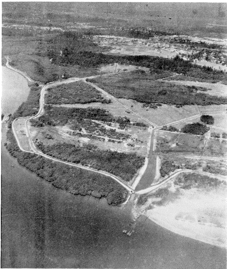
Aerial view of part of the drainage scheme at Apapa showing the sluice gate, the bund with the facade drain and the inland system of channels.

"—500 blood-fed Anopheline females were captured day after day in each one-man tent of an anti-aircraft battery . . . 80% of all ranks of this battery contracted