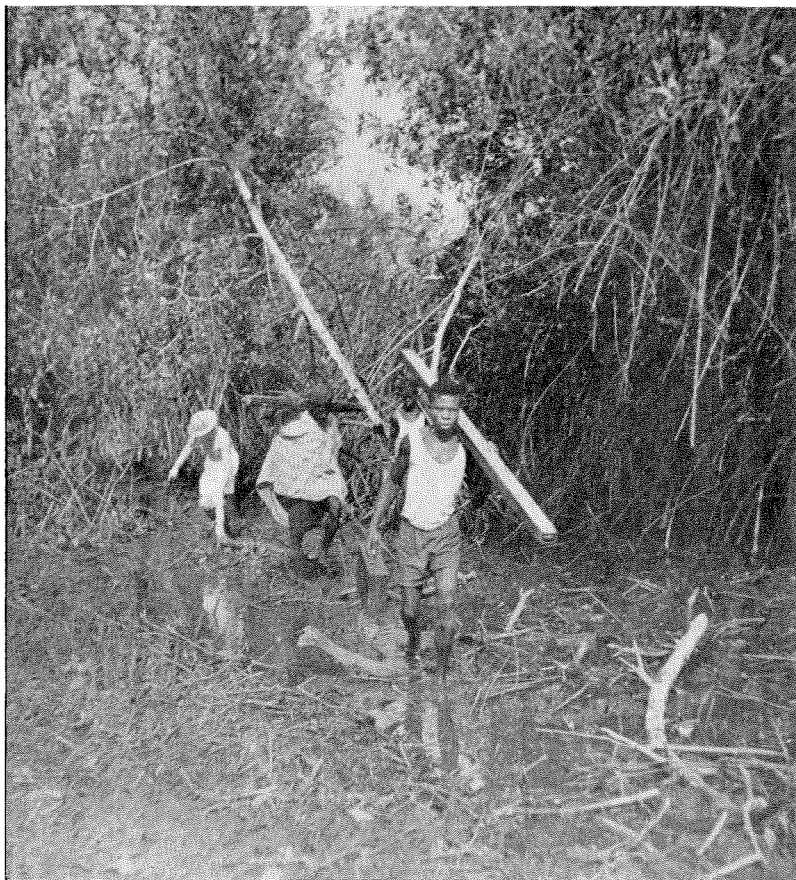
Inland fringe of an untouched mangrove swamp between the Rhizophora and Avicennia zones. Note numerous shallow pools breeding An. gambiae melas .

phora racemosa May) growing in a bed of black mud flats. The second zone is composed either of large patches of white mangrove ( Avicennia nitida Jaq.) growing in patches of bare sandy soil or surrounded by salt marsh grass ( Paspalum vaginatum ). The white mangrove tree is very different from the red mangrove; while the latter consists mainly of a dense tangle of aerial stilt roots with hardly any trunk (as seen in Lagos), the Avicennia tree has a large and handsome crown supported by an often contorted trunk