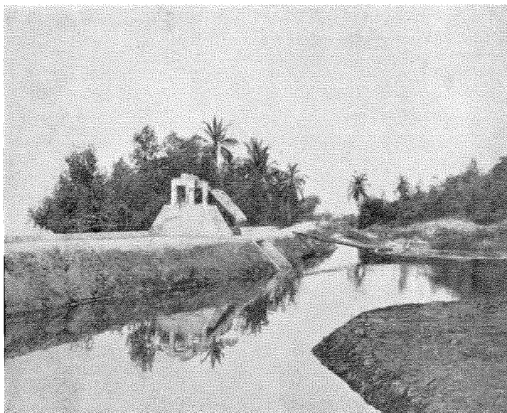
Sluice gate, the bund and the facade drain. Note behind the sluice gate the palm-thatched hut of the operator and the palm-trunk bridge.

The system of inland channels depends entirely on the topography of the area. As a general rule the facade drain is connected with the contour or hill-side drain dug round the inland limit of the swamp. All isolated higher levels are also provided with contour drains and the vast stretches of Paspalum grass are drained by small herring-bone or separate drains.