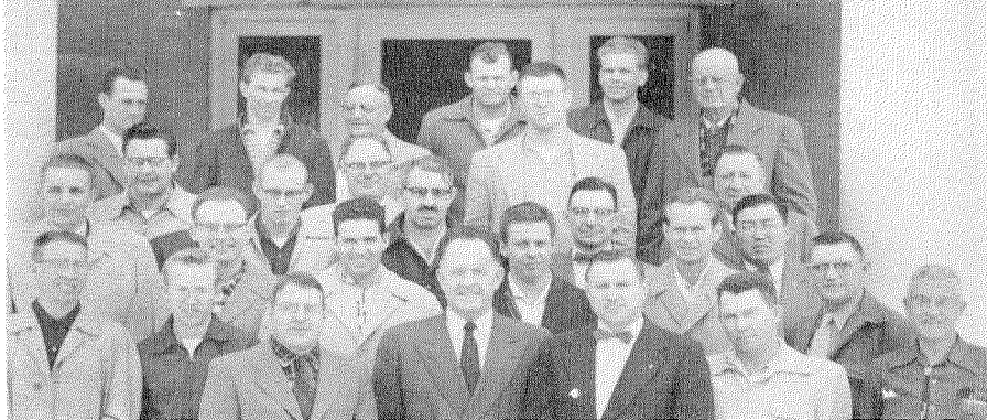
Some of the Members Attending the Training Course for Mosquito Control Specialists Held in Utah, February 21-25, 1956