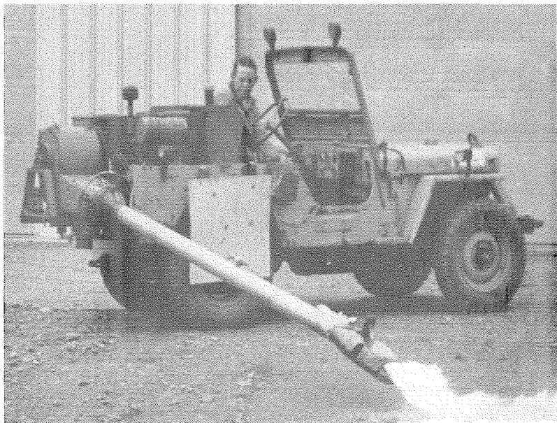
FIG. 1.—Weed burner mounted on mist blower.

ment is not in use. In consideration of such a work schedule, the Colusa Mosquito Abatement District has developed