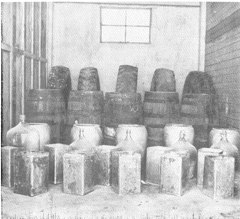
FIG. 2.—Five "standard sets" of artificial containers that are common breeding places of Aedes aegypti in the Caribbean area, as used by the cooperative Aedes Aegypti Testing Laboratory at Kingston, Jamaica, to evaluate candidate larvicides for use in aegypti eradication operations in the Caribbean area.

Figure 2 is a picture of five "standard sets" of containers as they were set up for