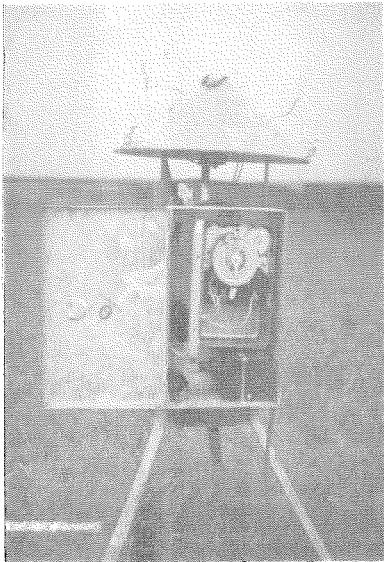
FIG. 1.—Timing device installed on light trap.