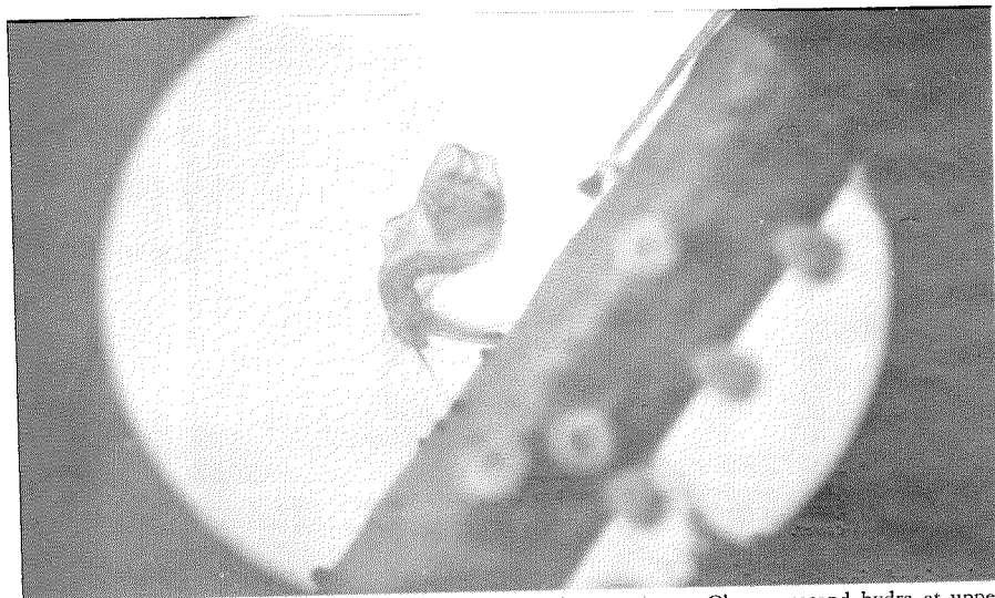
FIG. 2.— Culex peus second instar larva engulfed by Hydra americana . Observe second hydra at upper end of twig extending in direction of capture.

POLLUTION RESPONSE. Hydra are generally found associated with clear unpol-