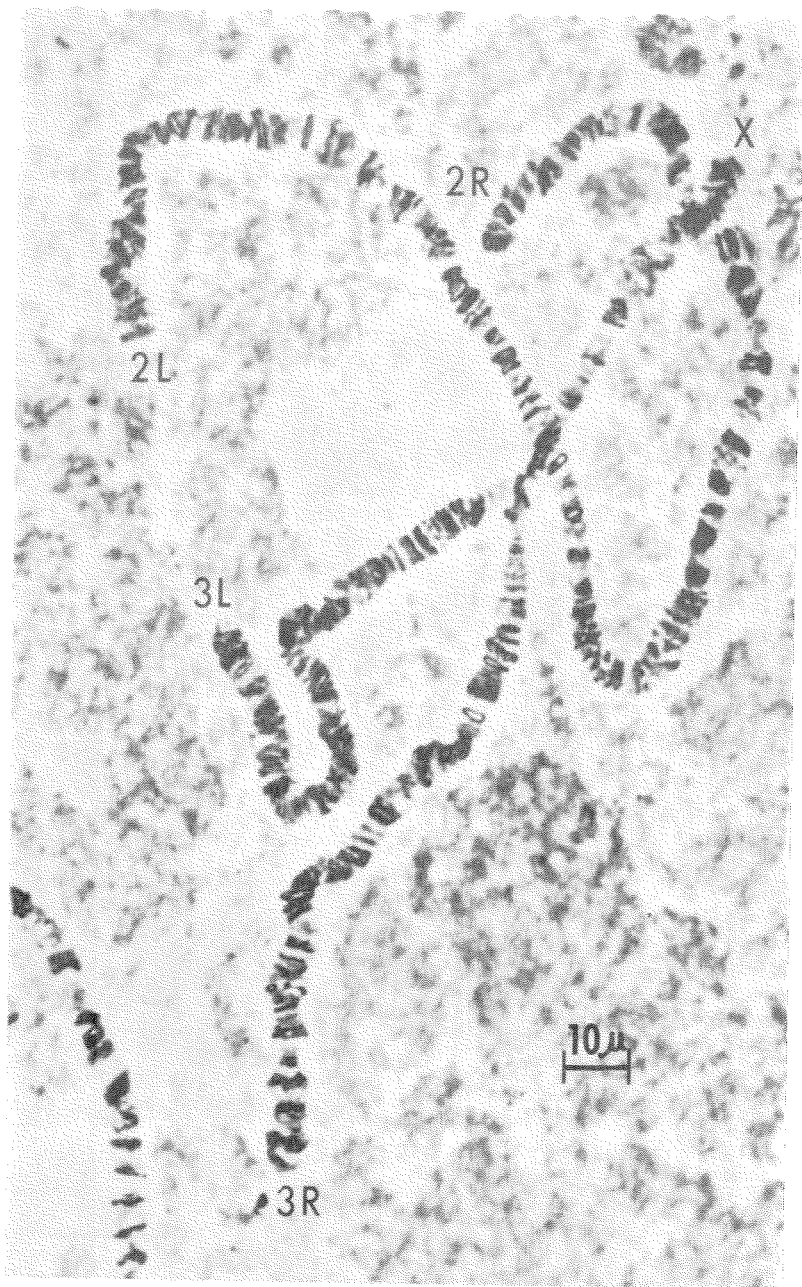
FIG. 1.—Salivary gland chromosome complement of Anopheles albimanus . X, 2R, 2L, 3R, 3L are the X chromosome, the right and left arms of chromosome two and the right and left arms of chromosome three, respectively.