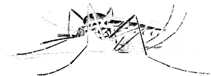
Fig. 1. Female Armigeres (L) annulitarsis with hind legs lowered so the eggs are in contact with water surface.

After oviposition, the females rested on the water surface with their hind legs lowered so that the egg masses were in contact with the water and remained in that position until hatching occurred (Fig. 1). When first observed the eggs were a light cream color, but they darkened to a light brown color prior to hatching. Hatching occurred during the night and early morning hours approximately 2 days after oviposition. After hatching was completed, the mosquitoes alternately moved their hind legs from front to rear until the empty egg shells were dislodged. Once a leg was freed, it was used to rub the egg shells from the other. On several occasions, when females were disturbed before their eggs had