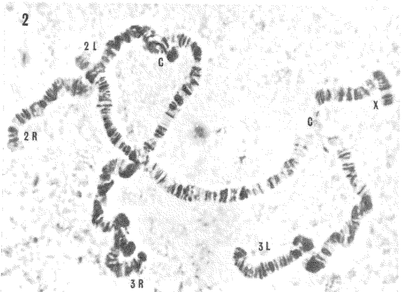
Fig. 2. Entirely synaptic salivary gland chromosomes from an F_1 hybrid of interstrain cross (Yakumo x Okayama) of lesteri .