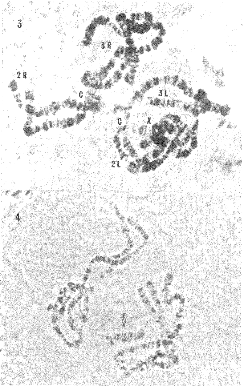
Fig. 3. Entirely asynaptic salivary gland chromosomes from an F 1 hybrid of (Kanoya strain of sinensis x Okayama strain of lesteri ).