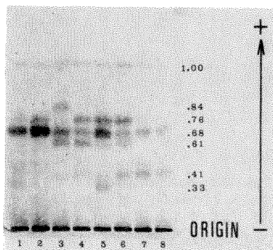
Figure 2. Zymogram of eight adult mosquitoes. See text for further explanation.

Certain Melanoconion species have been involved with disease transmission, but many of these species cannot be easily identified with usual taxonomic char-