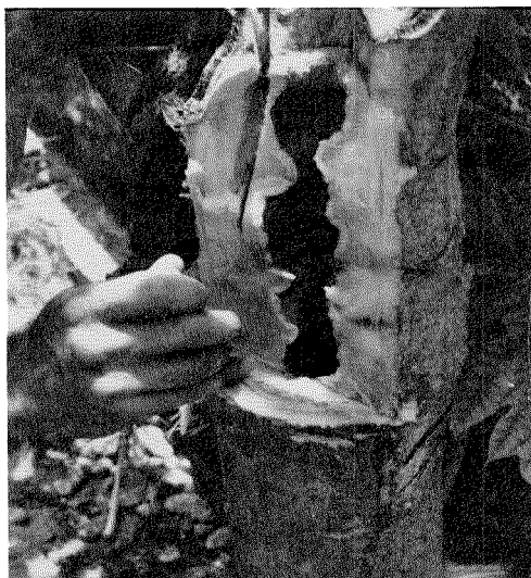
Fig. 1. Papaya trunk, Funafuti, Tuvalu, after chopping into the central cavity to sample aedine larvae.

On Funafuti (the group's most populous island, and administrative center) in Phase 1, and on Vaitupu in Phase 2, the DHF vector was recorded from uncharacteristic larval habitats. In particular, it was