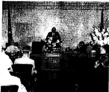
Mayor Reed presiding at induction ceremony.