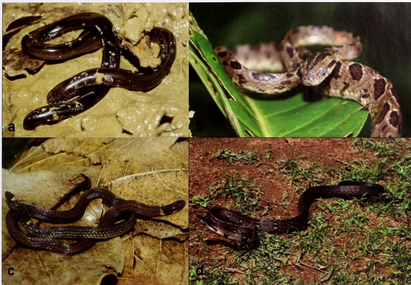
Fig. 2. a. Typhlops siamensis (ZFMK 88922); b. Boiga multomaculata (ZFMK 88923); c. Calamaria pavementata (ZFMK 88924); d. Coelognathus flavolineatus (ZFMK 88898).

Specimen examined: One subadult specimen (ZFMK 88924), collected by K. D. Le in June 2008, in Cat Loc area, Lam Dong Province (near 11°37'22.5"N 107°17'57.2"E, 135 m a.s.l.).