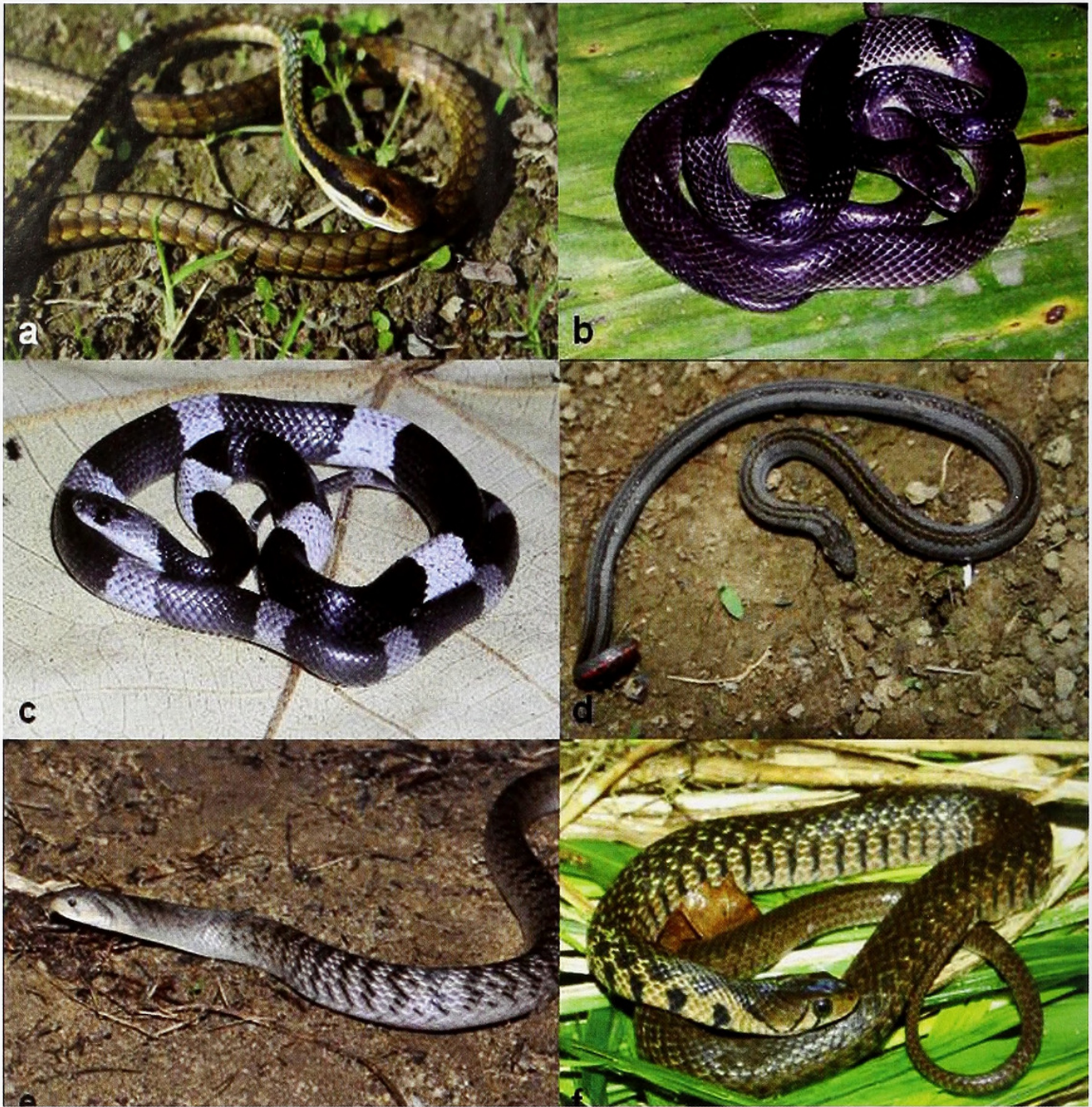
Fig. 3. a. Dendrelaphis ngansonensis (ZFMK 88913); b. Lycodon subcinctus (adult, IEBR A.2010.42); c. Lycodon subcinctus (juvenile, ZFMK 91899); d. Oligodon devei (ZMMU NAP-02811); e. Oligodon ocellatus from Cat Tien National Park, Dong Nai Province (e); f. Xenochrophis flavipunctatus (ZFMK 88914).

Specimens examined: One adult male (ZFMK 88913), collected by P. Geissler on 22 July 2008, in a secondary forest near Bau Sau Lake, Cat Tien National Park, Dong Nai Province (near 11°27'32.9"N, 107°20'43.7"E, 160 m a.s.l.). It was found in the morning, basking on a sunny spot on the lava-rock-covered forest floor.