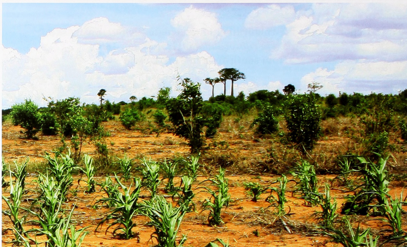
Fig. 1. Habitat of Voeltzkowia rubrocaudata : corn plantation (in foreground) near the village of Andranomaitso, Commune rurale de Sakaraha.