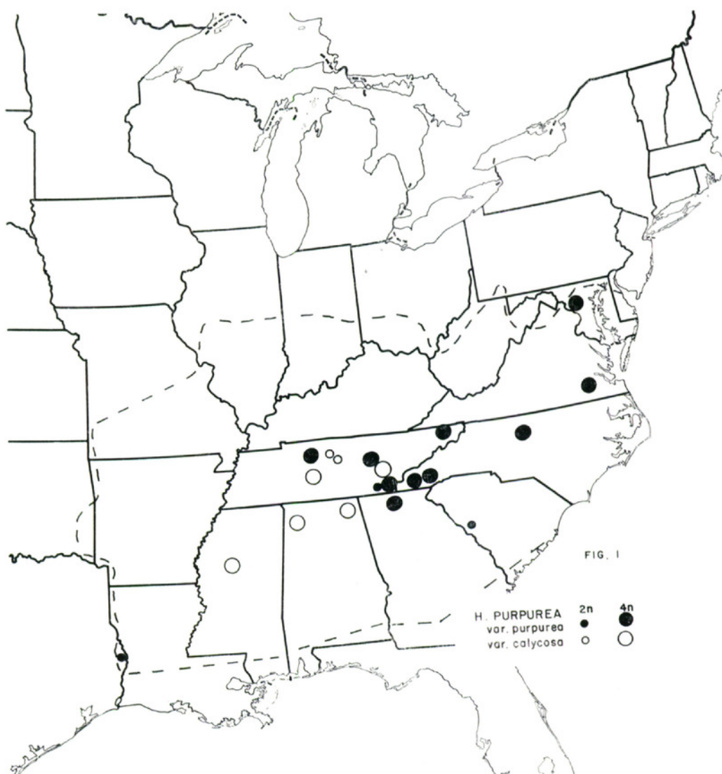
Figure 1. Generalized range (enclosed by dashed line) of H. purpurea and locations of diploid and tetraploid collections. Var. montana not shown. New England distribution of var. calycosa not shown.

In contrast to H. purpurea , H. longifolia has almost twice as many 2n populations as 4n . These are found in the north