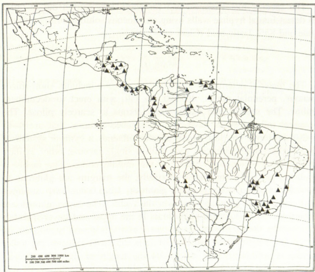
Figure 1. Distribution of Paspalum pilosum .

to field observations made by Dr. O. Morrone (pers. comm.), led us to consider P. peregrinum as a doubtful species, similar to P. pilosum . A detailed morphologic study of both species was performed in order to analyze diagnostic characters and to recircumscribe both species.