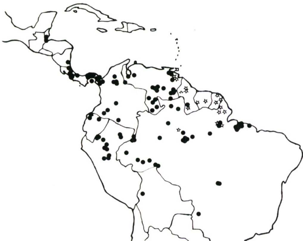
Figure 2. Distribution of Jacaranda copaia (Aubl.) D. Don ssp. copaia (stars) and J. copaia ssp. spectabilis (Mart. ex DC.) A. Gentry (circles).

southern Venezuela including parts of Bolivar and Monagas States immediately adjacent to the Delta Amacuro swamp forest.