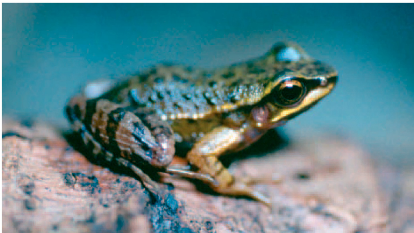
Figure 1. Adult male of Hylodes magalhaesi . Municipality of Camanducaia, State of Minas Gerais, Brazil. DOI: 10.1514/journal.arc.0040017g001

January 2002). A collecting permit was provided by Instituto Brasileiro do Meio Ambiente e dos Recursos Naturais Renováveis (IBAMA 02001.002792/98-03).