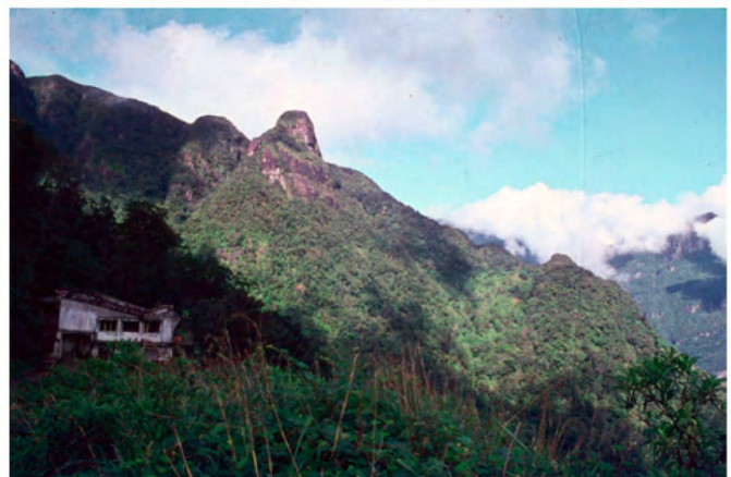
Figure 6. Lowland rain forest at Sinharaja (top) and montane forest in the Knuckles Range (bottom; cardamom factory in the foreground).

(Somaweera and Somaweera 2009). This recognition may be seen as a bottom-up approach, i.e. a taxon-specific approach to the issue of prioritizing biodiversity conservation, as used in the IUCN lists of threatened fauna and flora (see below). It may be seen as an indicator or a reaction to the fact that overall species and ecosystem conservation have been biased towards certain taxa (see above).