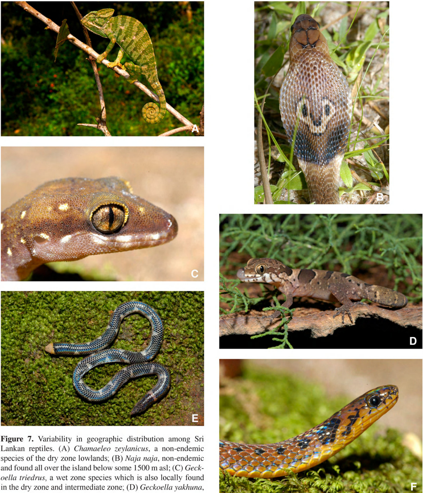
Figure 7. Variability in geographic distribution among Sri Lankan reptiles. (A) Chamaeleo zeylanicus , a non-endemic species of the dry zone lowlands; (B) Naja naja , non-endemic and found all over the island below some 1500 m asl; (C) Geckoeella triedrus , a wet zone species which is also locally found in the dry zone and intermediate zone; (D) Geckoeella yakhuna , restricted to the dry zone lowlands of the north; both species are endemic to Sri Lanka and need further study as regards to intraspecific variation. The status of the third species occurring in Sri Lanka ( G. collegalensis ) is unclear (Somaweera and Somaweera 2009); (E) Rhinophis homolepis , an endemic uropeltid snake found in the wet zone lowlands; fossorial amphibians and reptiles may be environmental indicators and key groups for an understanding of species evolution in Sri Lanka (see Gans 1993); (F) Haplocercus ceylonensis , an endemic colubrid snake found in the wet zone highlands.

(for examples of variation in status and distribution of species see Figs. 1 and 7). This approach may lead to a new insight regarding conservation aspects specific to the herpetofauna of Sri Lanka and be vital for overall or