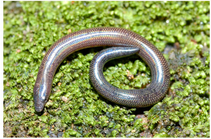
Figure 5. Two species of reptiles endemic to the Knuckles range, the gekkonid Cyrtodactylus soba (left) and the scincid Nessia bipes (right).

managed by the Forest Department and the Department of Wildlife Conservation (for details see Dela 2009). The most recent significant international achievement has been the recognition of the Central Highlands of Sri Lanka, including the Peak Wilderness Protected Area, the Horton Plains National Park, and the Knuckles Conservation Forest (see Fig. 5), as a World Heritage Site.