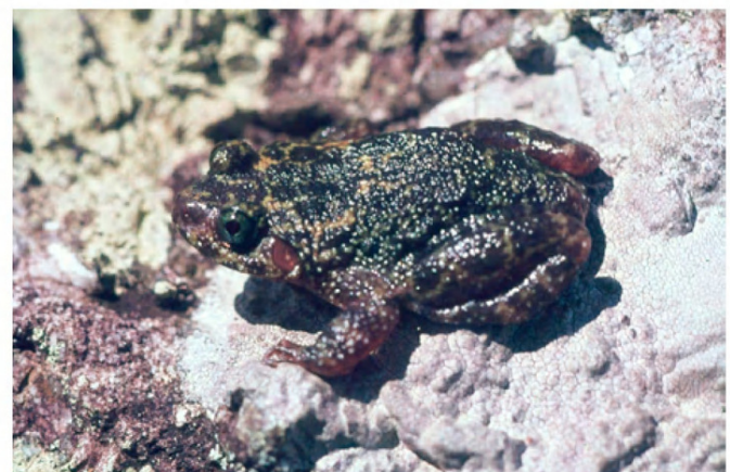
Figure 2. Tadpoles (top) and adult specimen (bottom) of Nannophrys marmorata , an endemic species restricted to the Knuckles range; Critically Endangered. Mainly found under boulders on wet, flat, rocky surfaces (Dutta and Manamendra-Arachchi 1996; confirmed by own observations). The genus is endemic to Sri Lanka, comprising four species, one of them ( N. naeyakai ) described only in 2007 (Fernando et al. 2007).