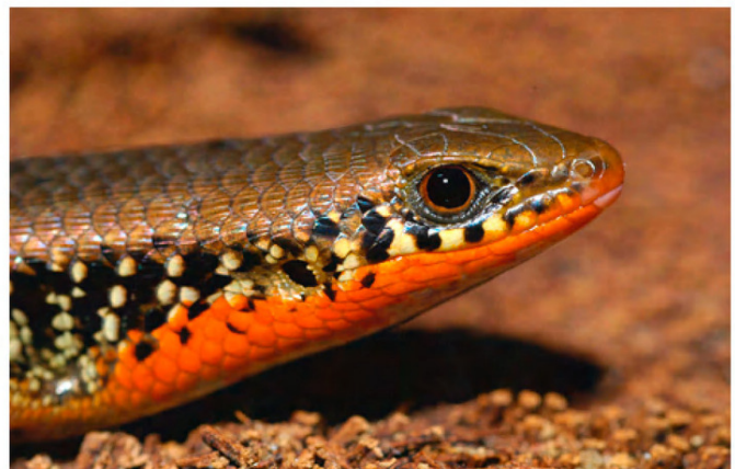
Figure 4. Range restricted endemic forest lizards. Top left: Ceratophora tennentii , male; top right: Cophotis ceylanica , male; bottom left: Calotes liocephalus , juvenile; bottom right: a newly discovered endemic but widespread species of scincid lizard ( Eutropis tammanna ; described by Das et al. 2008).