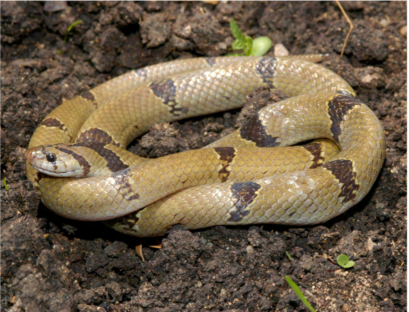
Figure 1. Oligodon arnensis , a non-endemic colubrid snake species found in the lowlands throughout the island, except the dry southeastern parts.