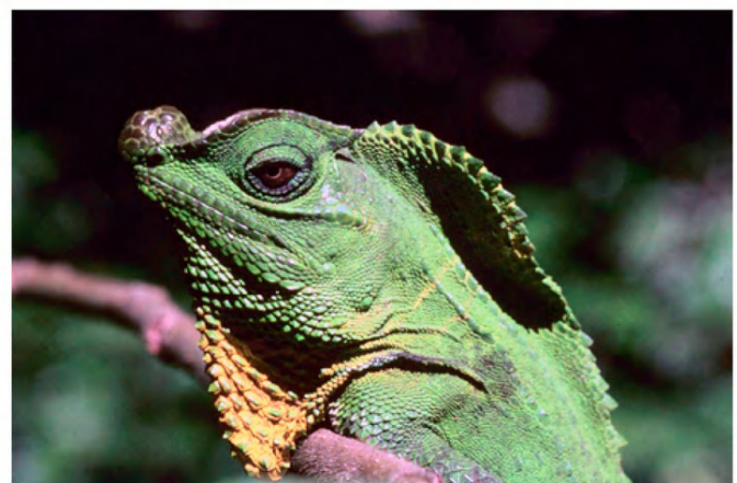
Figure 3. Male specimen of Lyriocephalus scutatus , the most charismatic lizard of Sri Lanka. The genus is monotypic and endemic to Sri Lanka.

Although our knowledge of Sri Lankan herpetofauna has considerably improved, new species still await discovery. This applies particularly to amphibians where traditional morphological approaches have fallen short of adequately describing species diversity (for comparison see Oliver et al. 2009; Stuart et al. 2006; Vieites et al. 2009). Modern genetic analyses have shown a much higher species diversity than previously expected (overview in Pethiyagoda et al. 2006). In addition, new species of reptiles have been discovered during the last years of intensified field work in Sri Lanka. This includes "seemingly" better known agamid genera such as Calotes , Ceratophora , Cophotis , and Otocryptis (for an overview, see references in Bahir and Surasinghe 2005 and Somaweera and Somaweera 2009; Fig. 4). In addition, new species of scincid and gekkonid lizards and snakes were recently