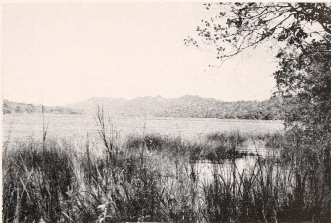
The northern end of Laguna Ocotal. The pine-covered ridges parallel the southwestern shore of the lake.