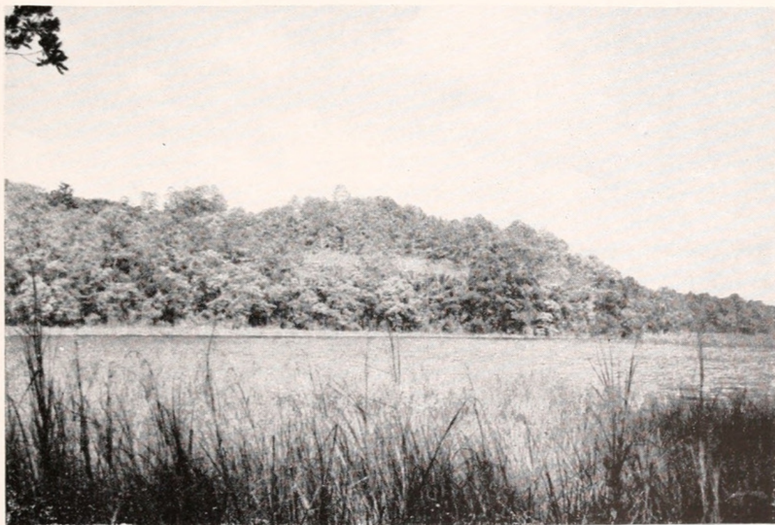
A small hill covered by pines projects from a low deciduous forest ( monte ; see Dressler, pp. 200) near the campsite at Laguna Ocotal. The lofty tropical evergreen forest begins behind the hill and is not visible.