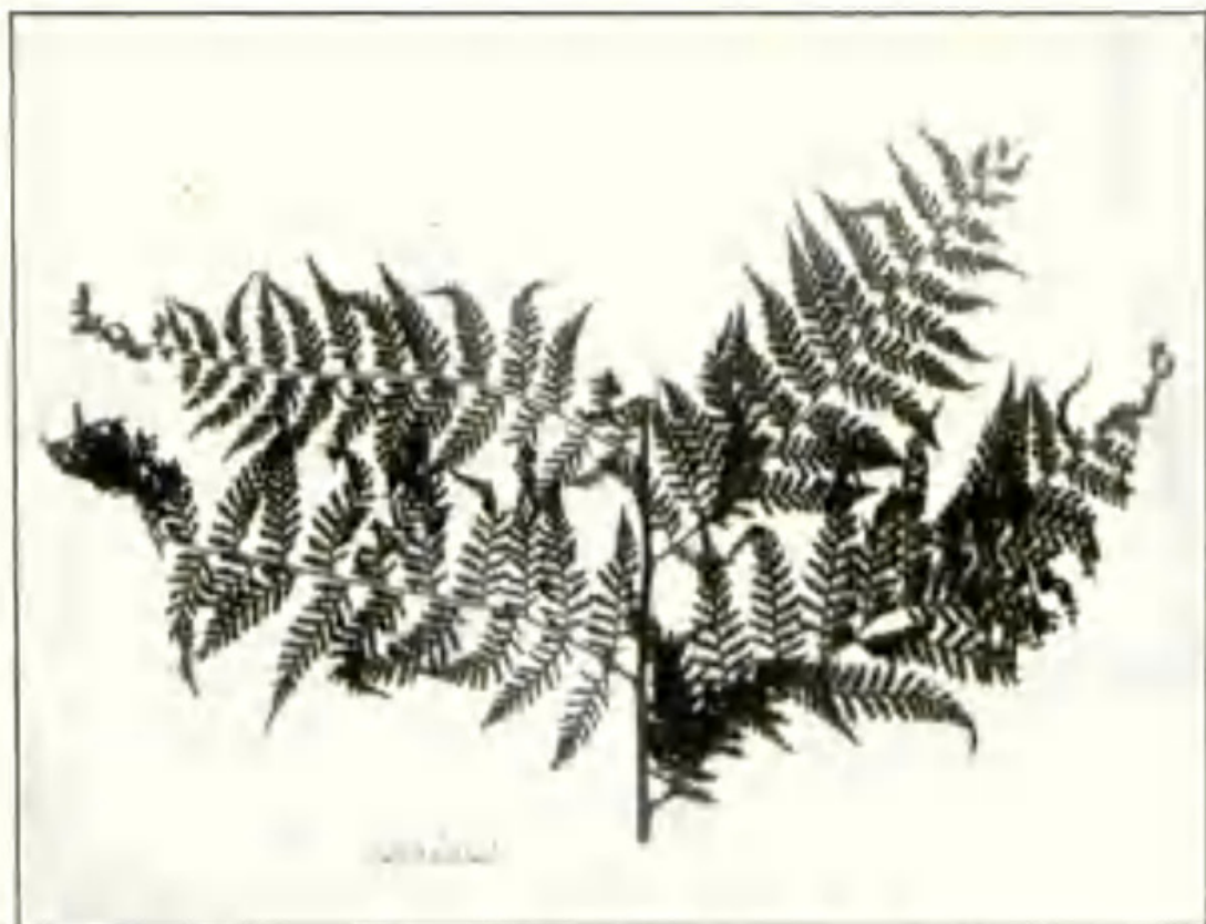
Hypolepis tenuifolia (Forst.) Bernh., var. hirsuta White and Goy.

Rhizome branched, creeping, rather sparsely clothed with small lanceolate deciduous scales. Stipes rather stout, erect, smooth; rhachises clothed with a few small lanceolate-fimbriate, deciduous scales at the forkings, and sometimes along the whole branch. Fronds 35-150 cm. high, repeatedly and compactly dichotomous, the branches sometimes spreading in a horizontal