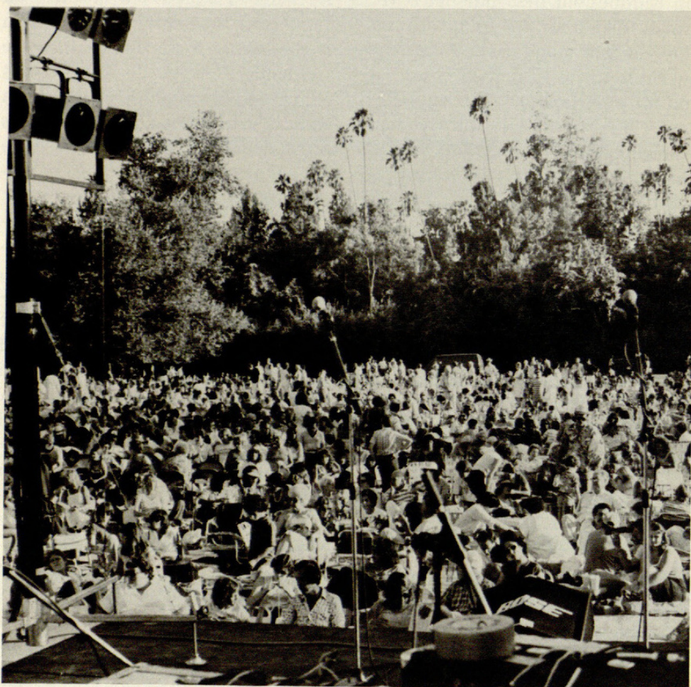
More than 4,000 people crowd the Arboretum grounds for Rick Nelson's Picnic in the Park summer concert.