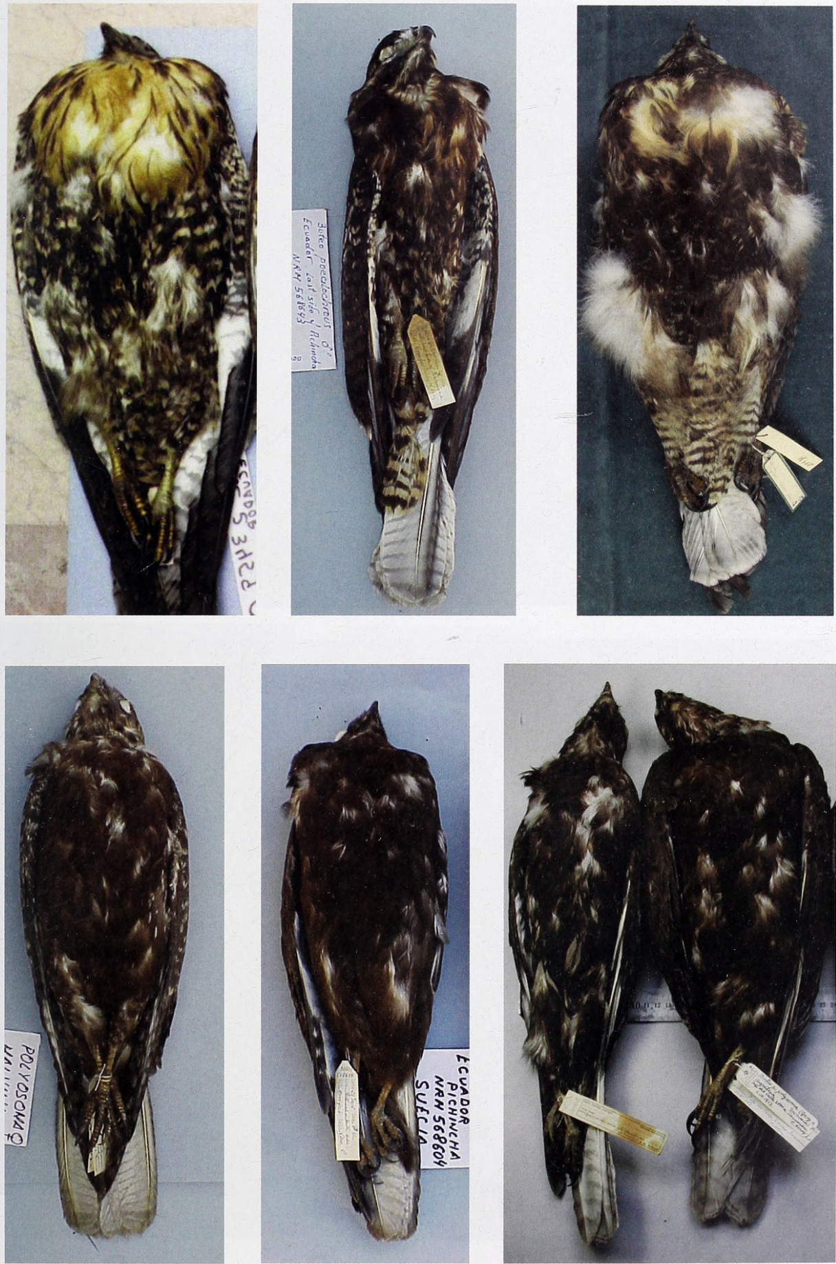
Figure 3. Upper images, dark-morph first-year Gurney's Hawks B. poecilochrous, all from Ecuador (from left to right held at ZMUC, NHRM and ZMB); below, dark-morph first-year Variable Hawks B. polyosoma, from several countries; the left-hand specimen held at IRSNB, the others at NHRM