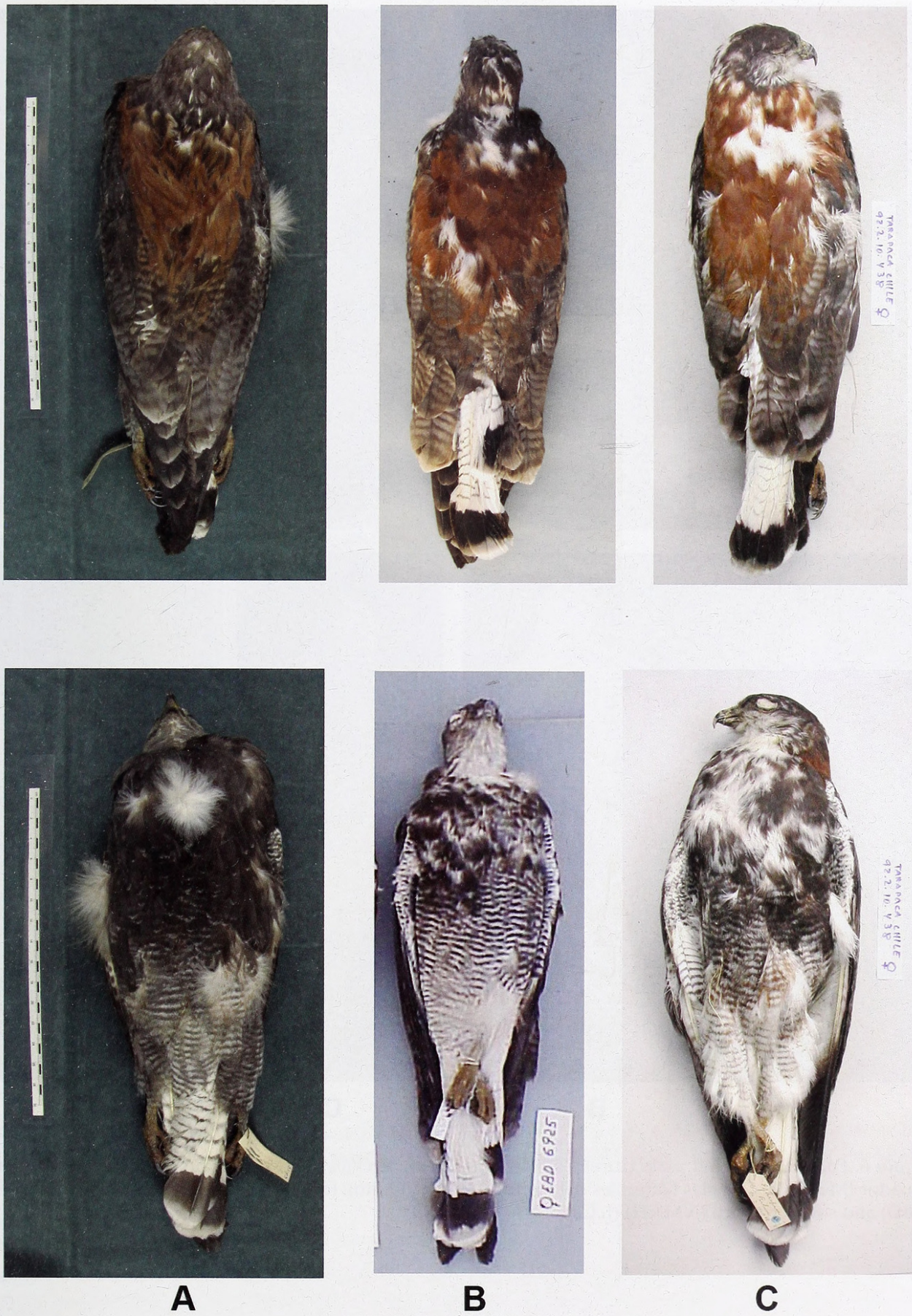
Figure 5. Dark-morph adult female Gurney's Hawks Buteo poecilochrous : (a) nominate subspecies from Ecuador (ZMB); (b and c) subspecies fielsai from Bolivia (EBD) and Chile (BMNH), respectively. Specimen (c) has a reddish tinge to the central underparts that is typical of pre-definitive plumage