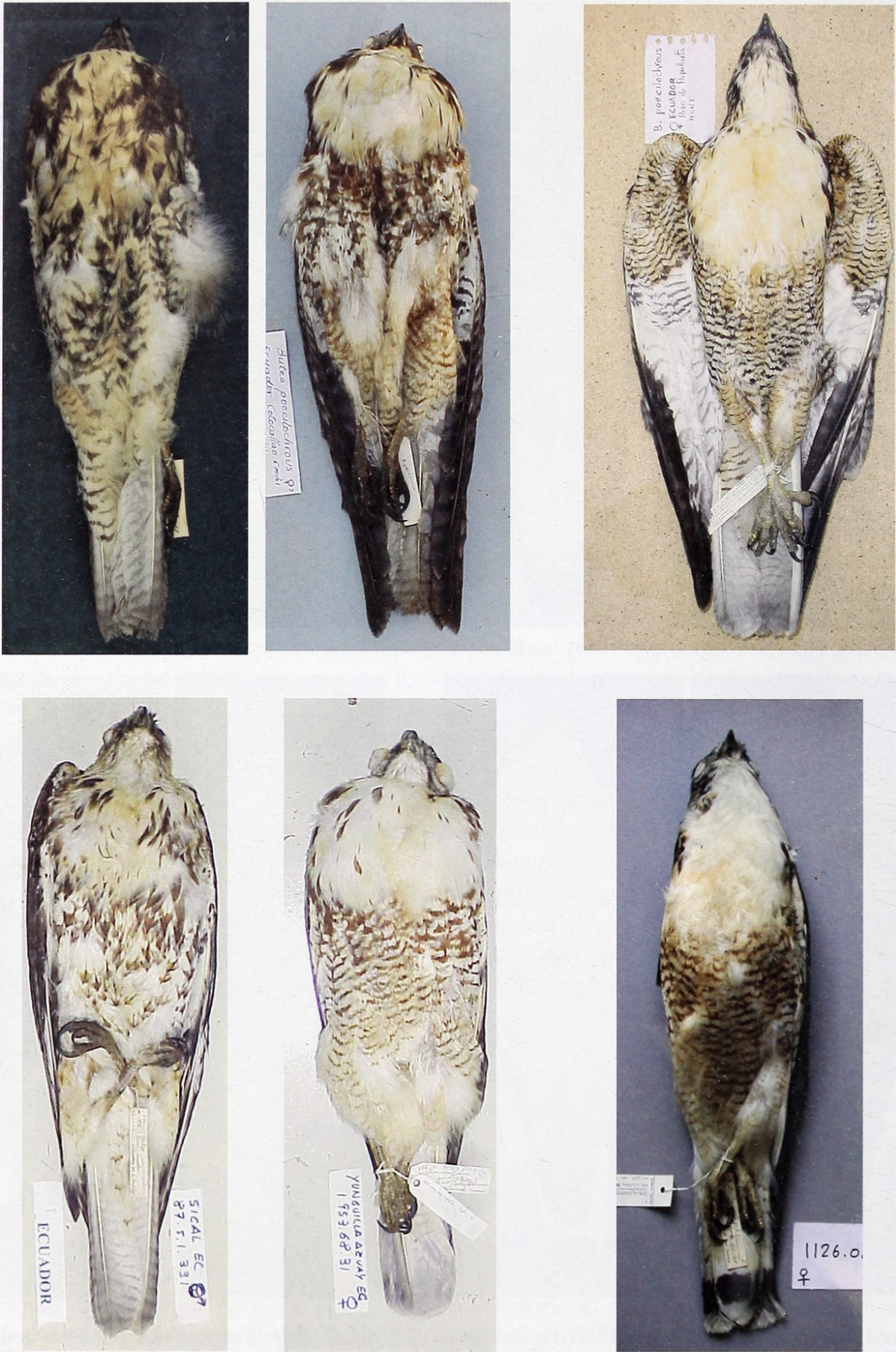
Figure 2. Upper images, pale-morph female Gurney's Hawks Buteo poecilochrous in, left to right, their first-, second- and third-calendar years (specimens held at ZMB, NHRM and MCNQ respectively); below, one first-calendar year male (BMNH) and two, second- (BMNH) and third-calendar year (MHNG), pale-morph female Variable Hawks B. polyosoma. All specimens of both species are from the Ecuadorian Andes, except one from the Colombian Andes