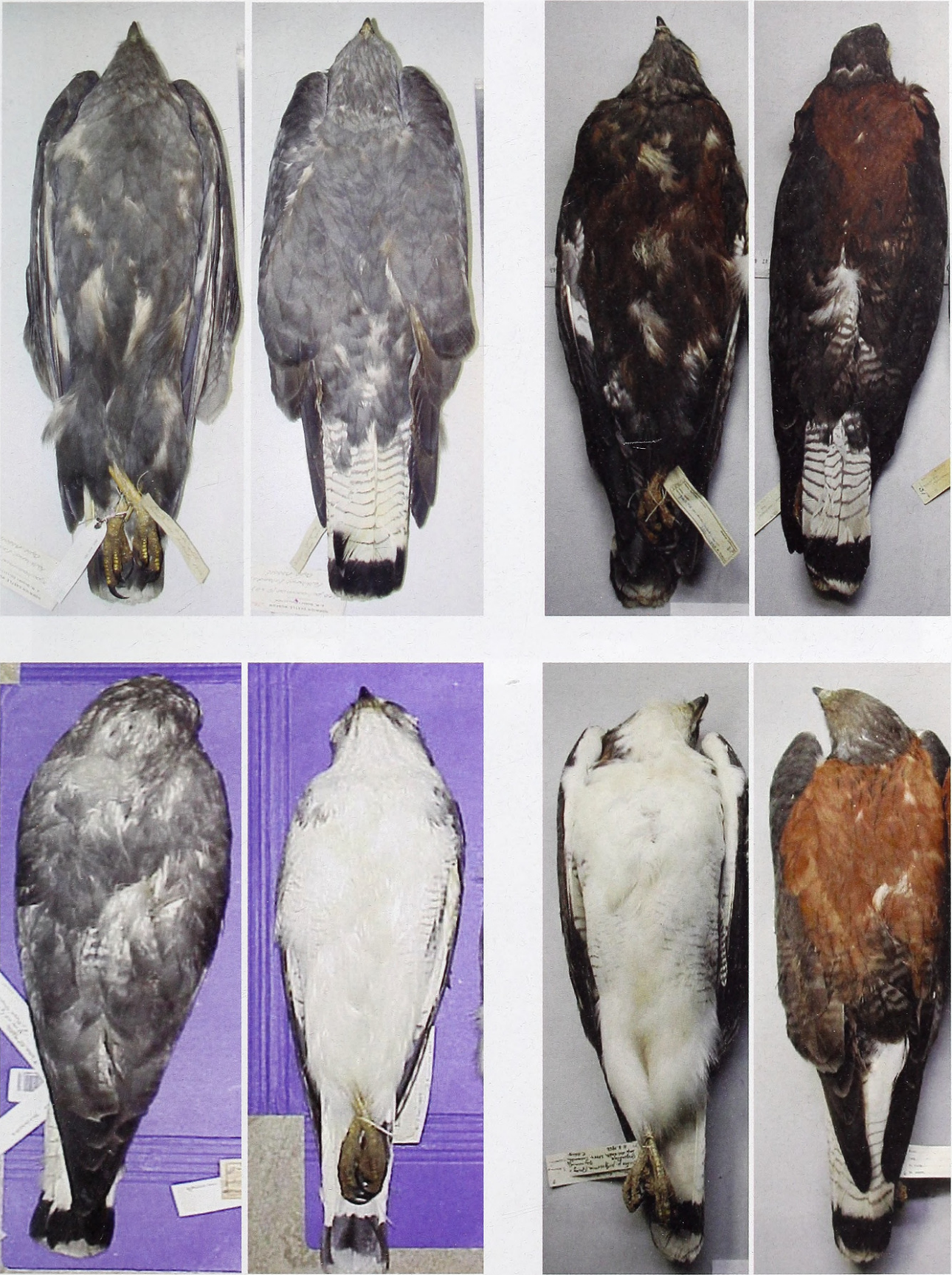
Figure 1. Upper images adult male (BMNH) and female (NHRM) Variable Hawks Buteo polyosoma in dark-morph plumage, ventral and dorsal views; below, adult and female pale-morph B. polyosoma held at ZMA and NHRM, respectively (J. Cabot)