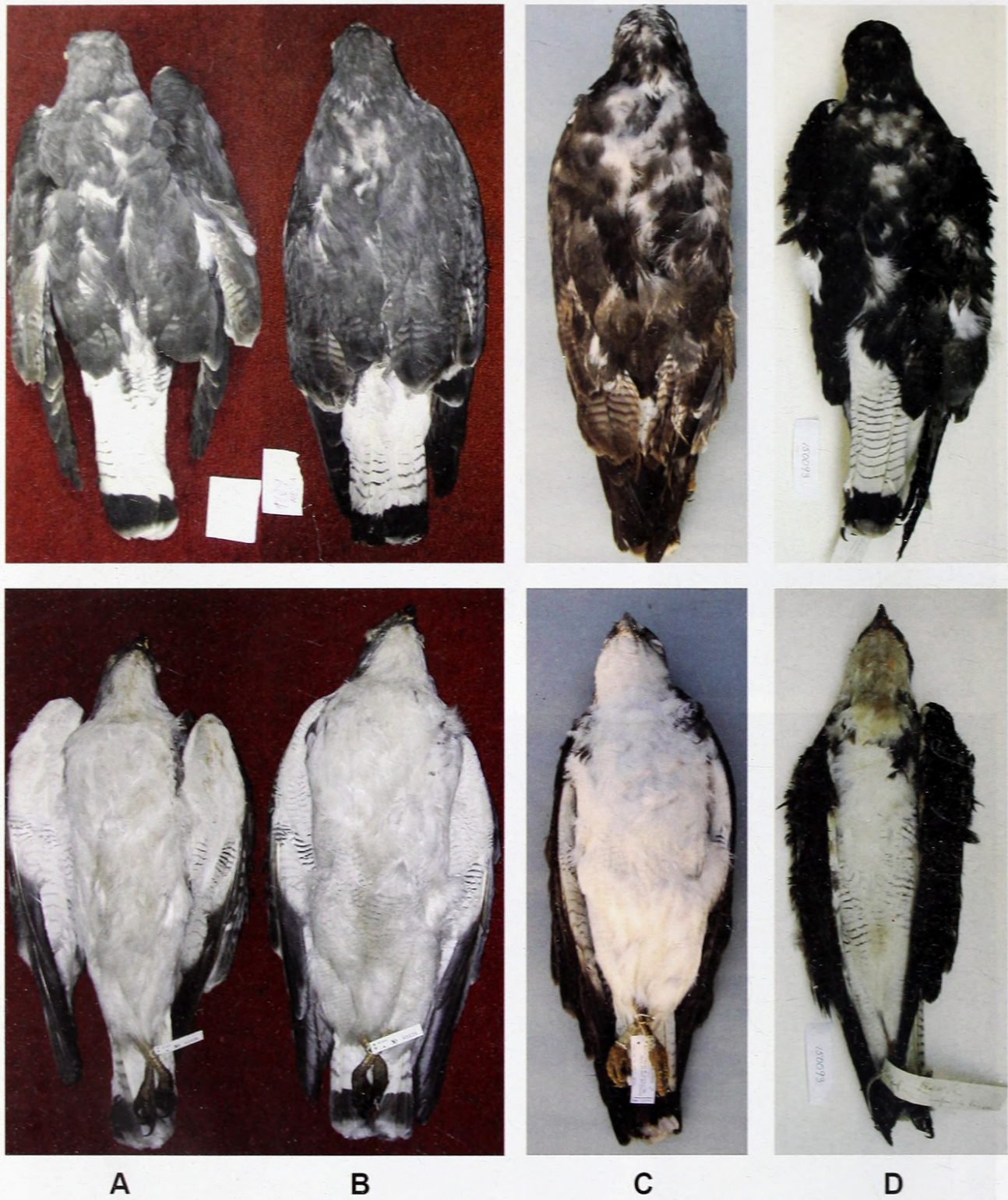
Figure 6. Pale-morph adult male Gurney's Hawks Buteo poecilochrous : (a and b) nominate subspecies from Ecuador (Museo de Ciencias Naturales del Instituto 'Mejía', Quito); (c and d) subspecies fieldsai from Bolivia (EBD) and southern Peru (NMNH) (J. Cabot)