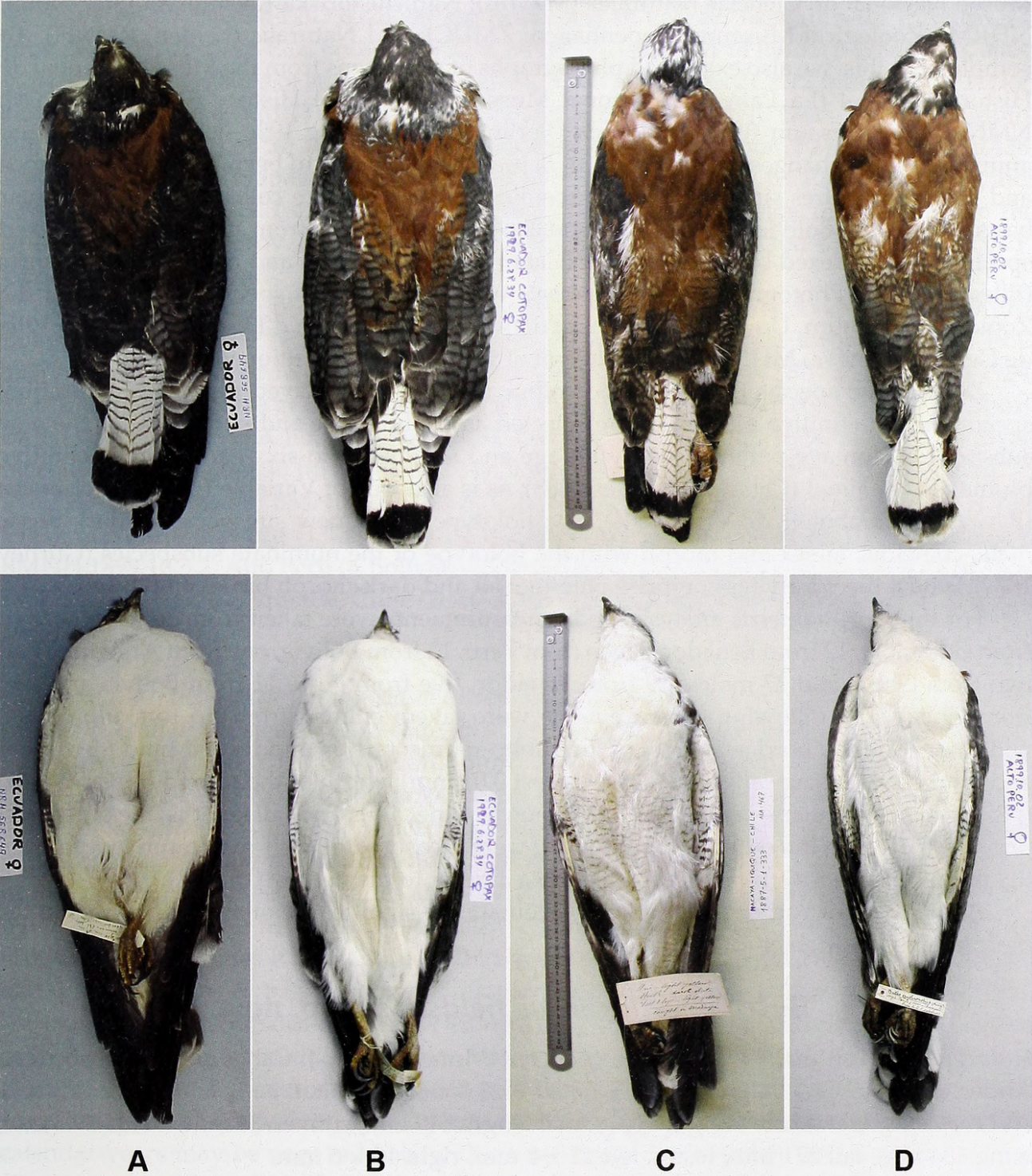
Figure 7. Pale-morph adult female Gurney's Hawks Buteo poecilochrous : (a and b) nominate subspecies from Ecuador; (c and d) subspecies fjeldsai from Bolivia and Chile (BMNH)