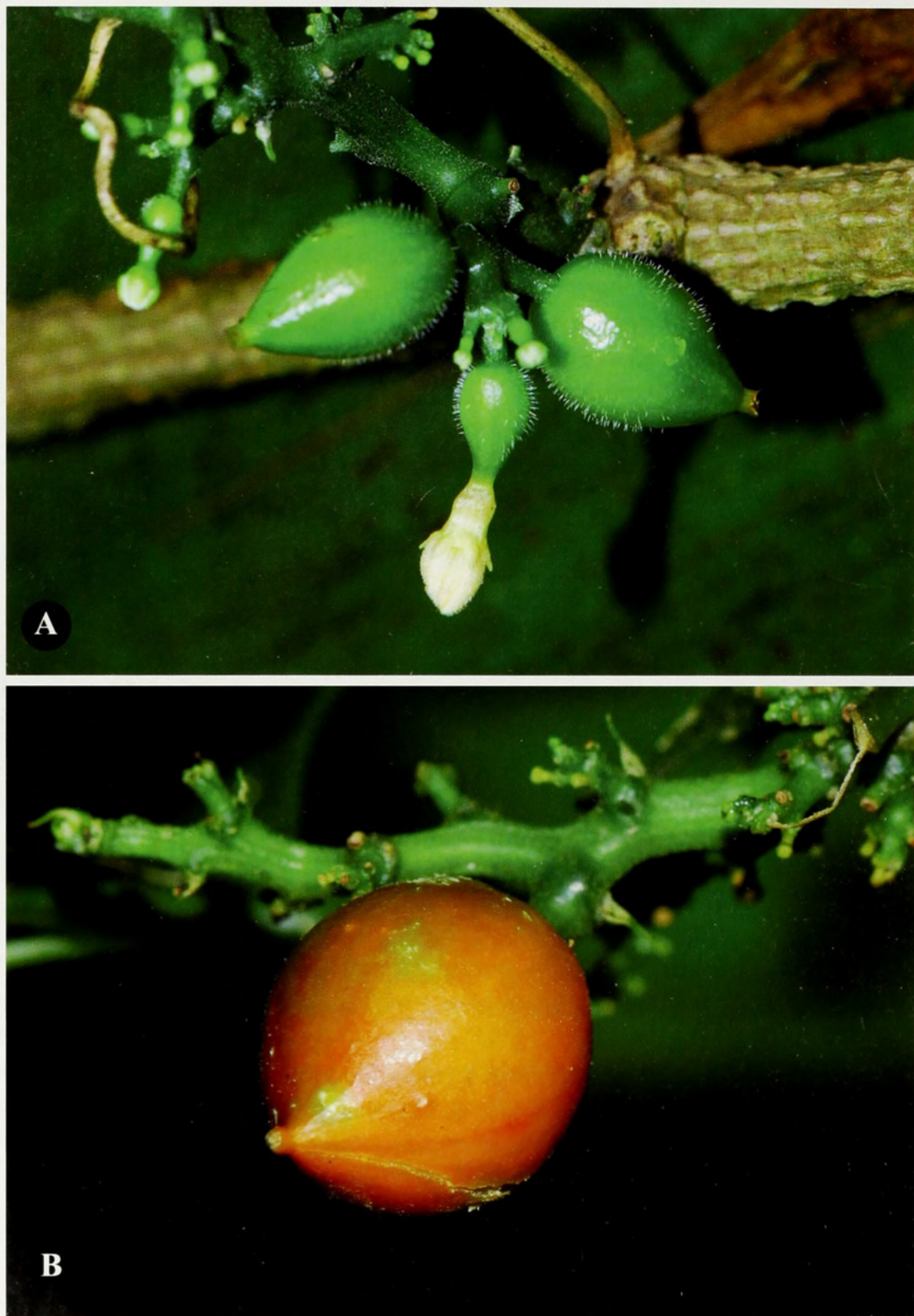
Figure 1. Kedrostis monosperma W.J.de Wilde & Duyfjes. A. Female inflorescence with flowers and young fruits; note hairy ovary; B. Infructescence with one ripe fruit. (Both photos taken at Pahang, Ulu Krau, Rezab Hidupan Liar Krau by de Wilde).