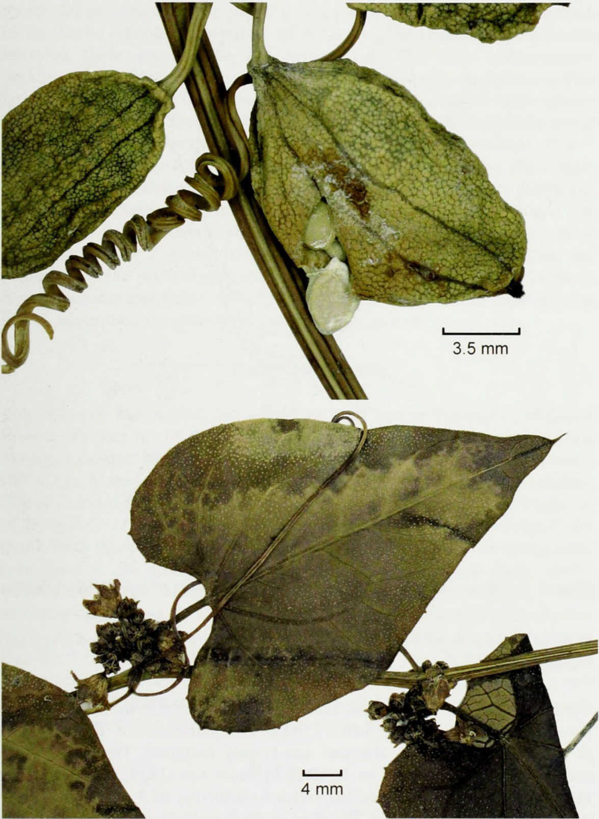
Figure 3. Details of two herbarium sheets of Zehneria baueriana : upper details of fruit showing one seed; lower details of female inflorescences (based on Hoogland 11220 , CANB).