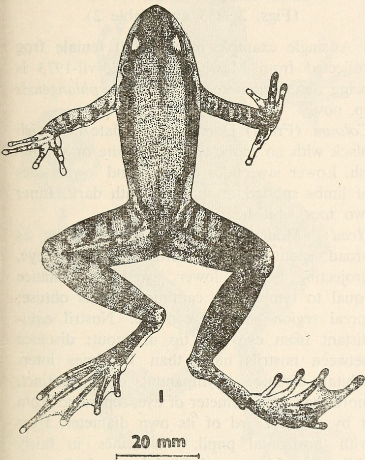
Fig. 1. Rana danieli sp. nov., Dorsal view.

Forelimbs : Fairly long, about half the length from snout to vent; fingers a little swollen at tip, without intercalary bone, first longer than second, third longest, as long as snout. Subarticular tubercles prominent.