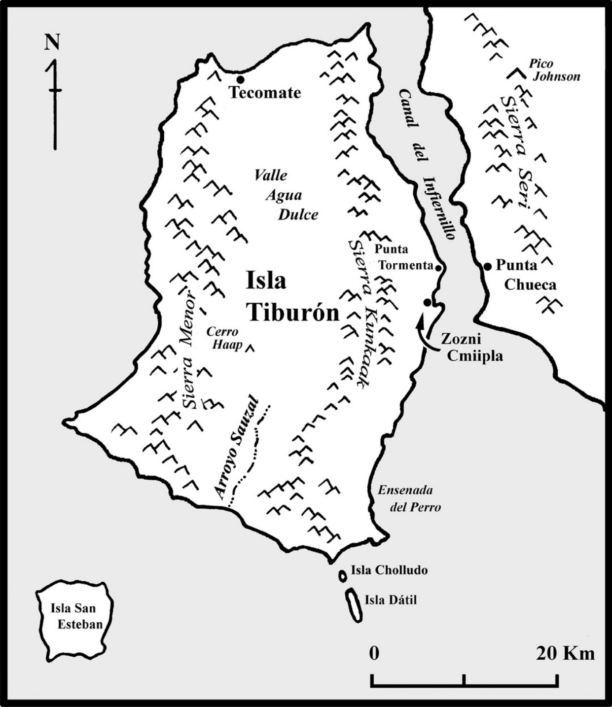
FIG. 2. Isla Tiburón and vicinity.