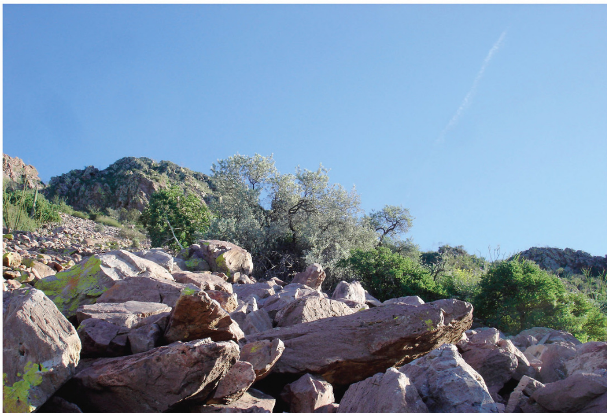
FIG. 3. Sierra Kunkaak. (A, top) Sheltered, interior canyon, ca 0.5 km up canyon from Siimen Hax waterhole. (B, bottom) Sideroxylon leucophyllum on talus slope on north side of Cerro San Miguel. Photos by Benjamin Wilder, 25 Nov 2006.