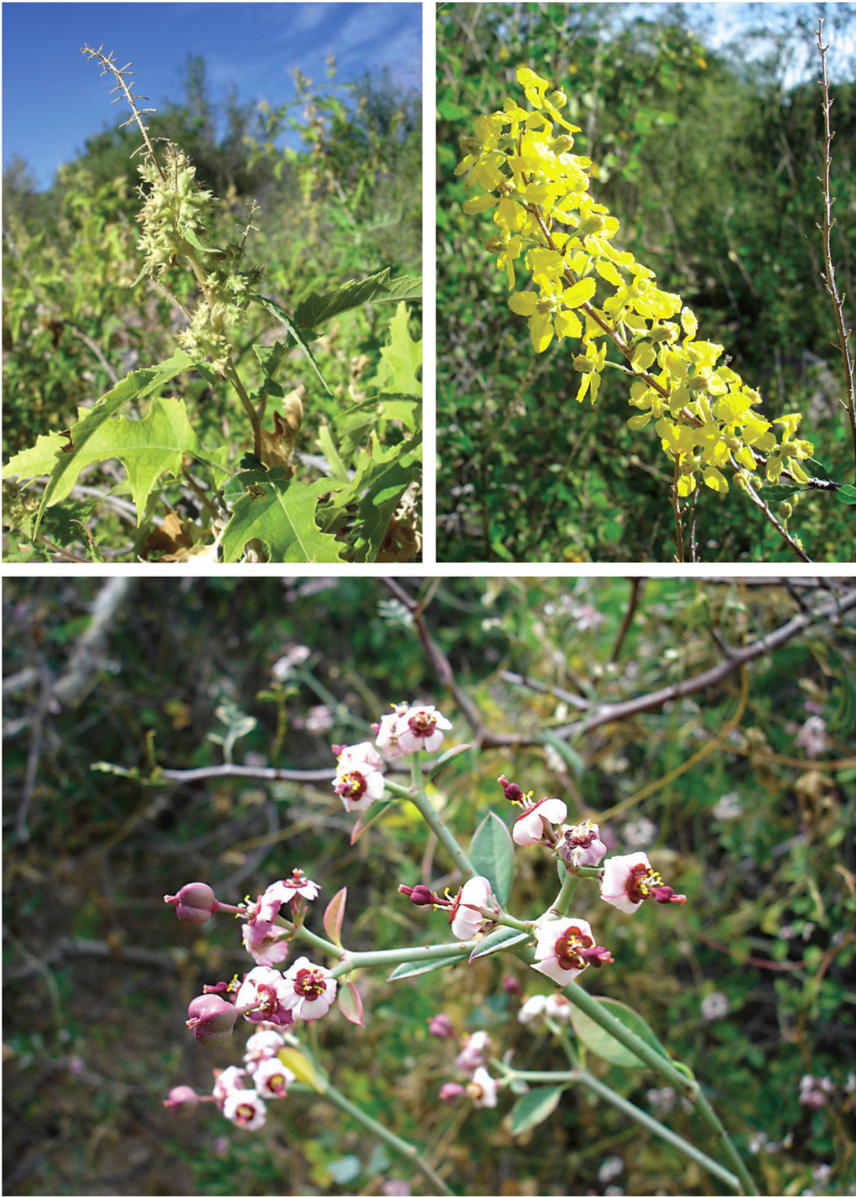
FIG. 4. New records from Sierra Kunkaak. (A, top left) Ambrosia carduacea (Wilder 06-383). (B, bottom) Euphorbia xanti (Wilder 06-453). (C, top right) Echinopterys eglandulosa (Wilder 06-377).