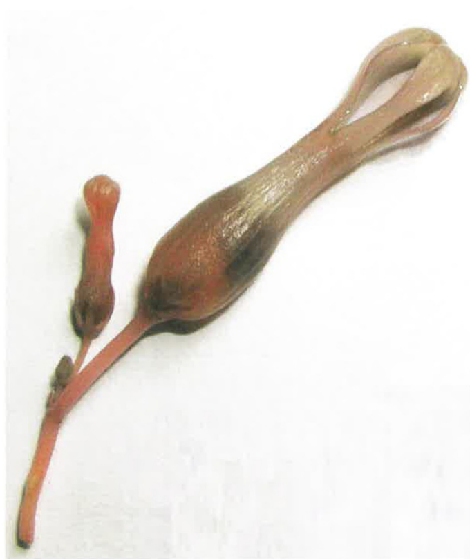
FIG. 4. A flower of Ceropegia hookeri .