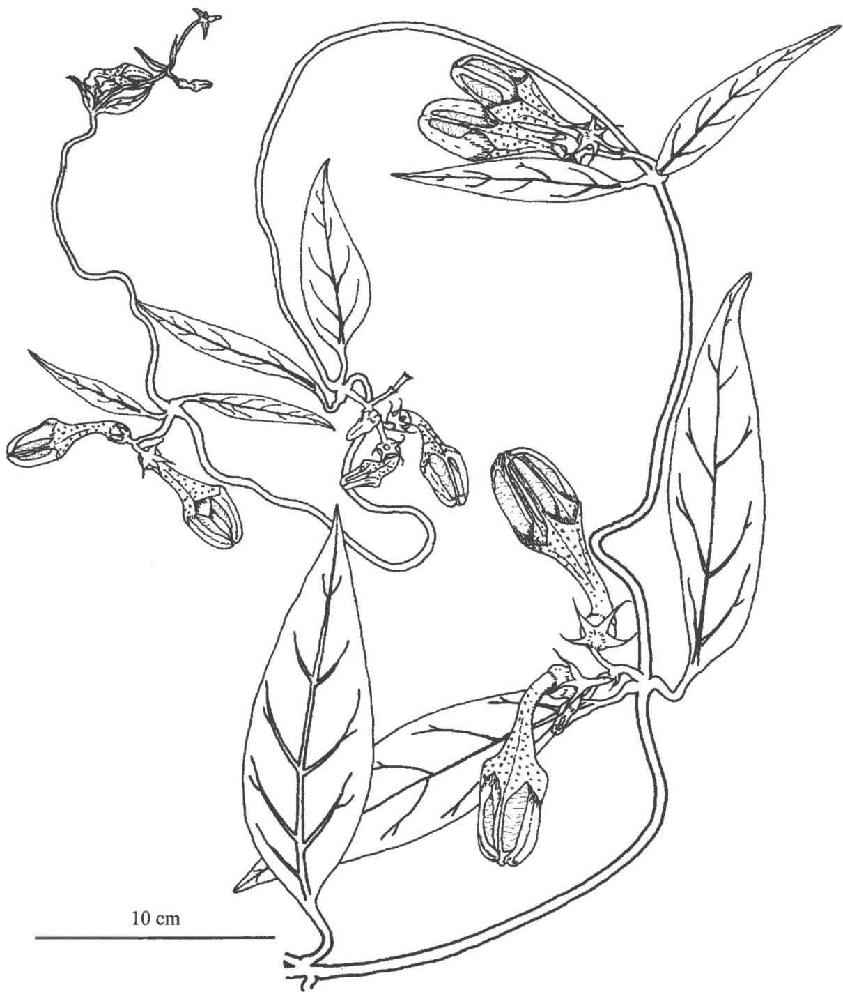
FIG. 3. Line diagram of Ceropegia lucida Wall.

Conservation threat. —The species is threatened by habitat loss due to a number of human activities. These include agricultural expansion, road building and grazing by domestic animals. A number of tourists also visit these areas and owing to its showy flowers, these plants become targets of removal, which is also poses a serious threat to the survival of this species.