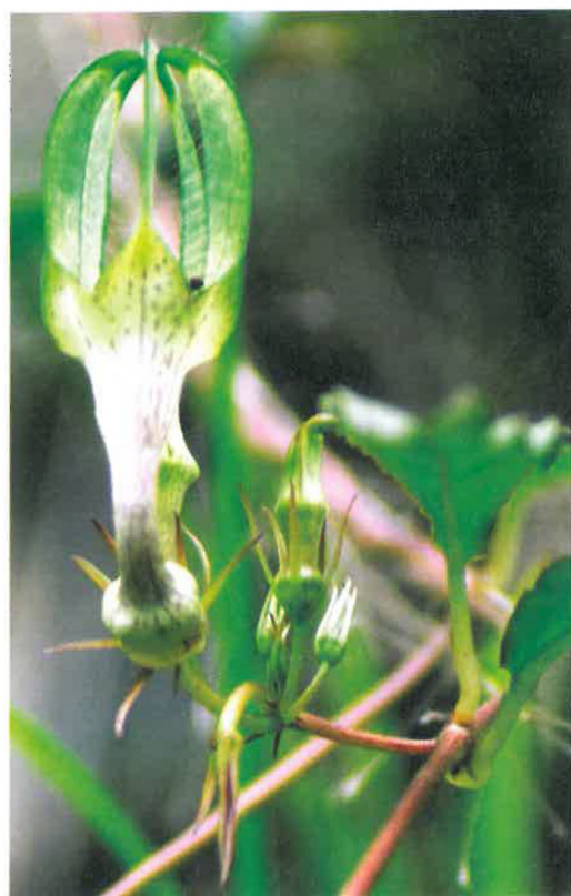
FIG. 5. A plant of C. lucida in its natural habitat. Note its showy flowers; the shape of the flower resembles a fountain from where the genus derives its name.

Long twining, sparsely hairy or glabrous herbs, with tuberous roots. Stem solid, long creeping, up to 2 m long. Leaves membranous, ovate or lanceolate, petiolate, 6.5–10.5 cm long and 1.5–2.5 cm wide; petiole short, 0.5–1.1 cm long. Peduncles short, 1.5–2 cm long, hairy in line. Flowers few (5), in axillary peduncled cymes; pedicels glabrous. Calyx small, about 0.7 cm long; corolla curved, 3.5–4.5 cm long, sparsely dialated at the base, green spotted with purple; upper corolla lobes linear, about 2 cm long, ciliate within the spatulate apex. Outer corona of 5 bifid-deltoid ciliate lobes; inner erect, linear-clavate.