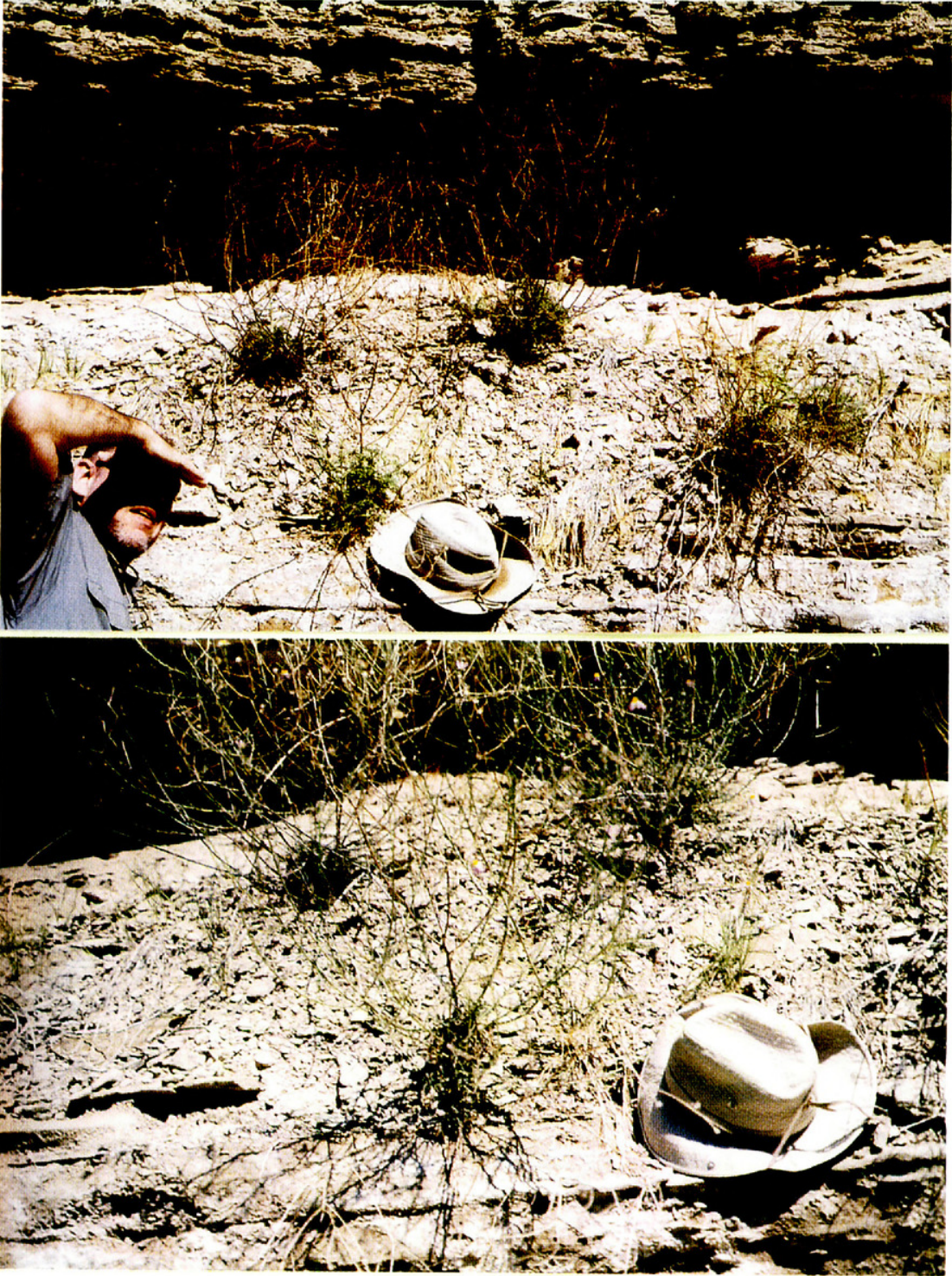
FIG. 1. Upper photo: four plants of Arida mattsurneri at the type locality, April 2003. Lower photo: same plants in flower at same site, July 2003.