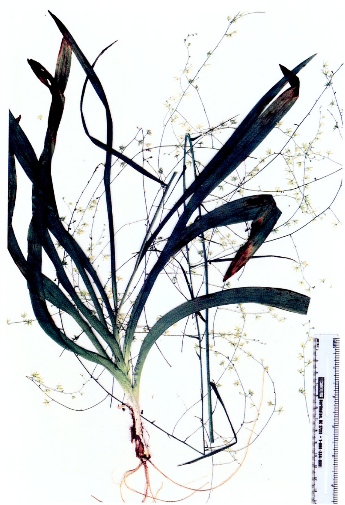
FIG. 1. Holotype of Stenanthium diffusum (Wofford 20051, TENN).