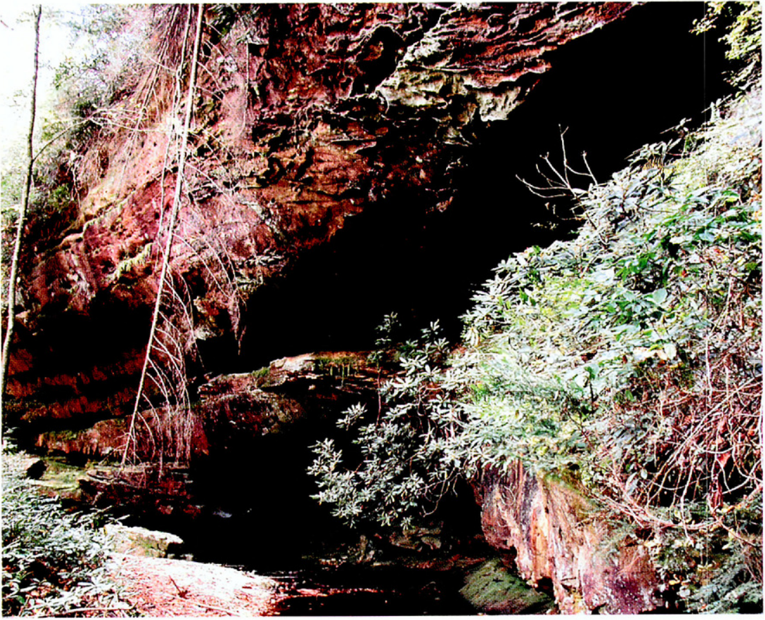
FIG. 5. Habitat of Stenanthium diffusum . Sandstone rockhouse formations at type locality, Ladder Trail, Pickett State Park, Pickett County, Tennessee.

gramineum occurs in a much broader range of ecological conditions in numerous habitats including rich woods, moist to dry woods, meadows, flood plains, prairies, and grassy balds. The following key is provided for ease of identification: