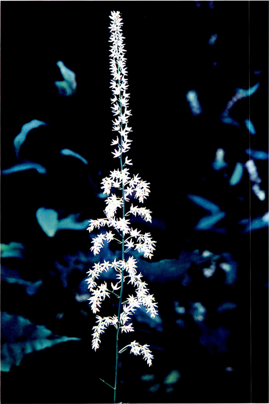
FIG. 3. Stenanthium gramineum habit at anthesis.