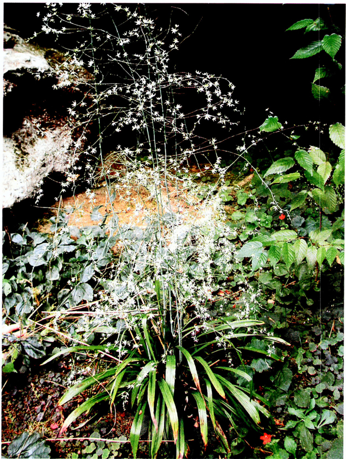
FIG. 2. Stenanthium diffusum habit at anthesis. Image taken at type locality, Ladder Trail, Pickett State Park, Pickett County, Tennessee.