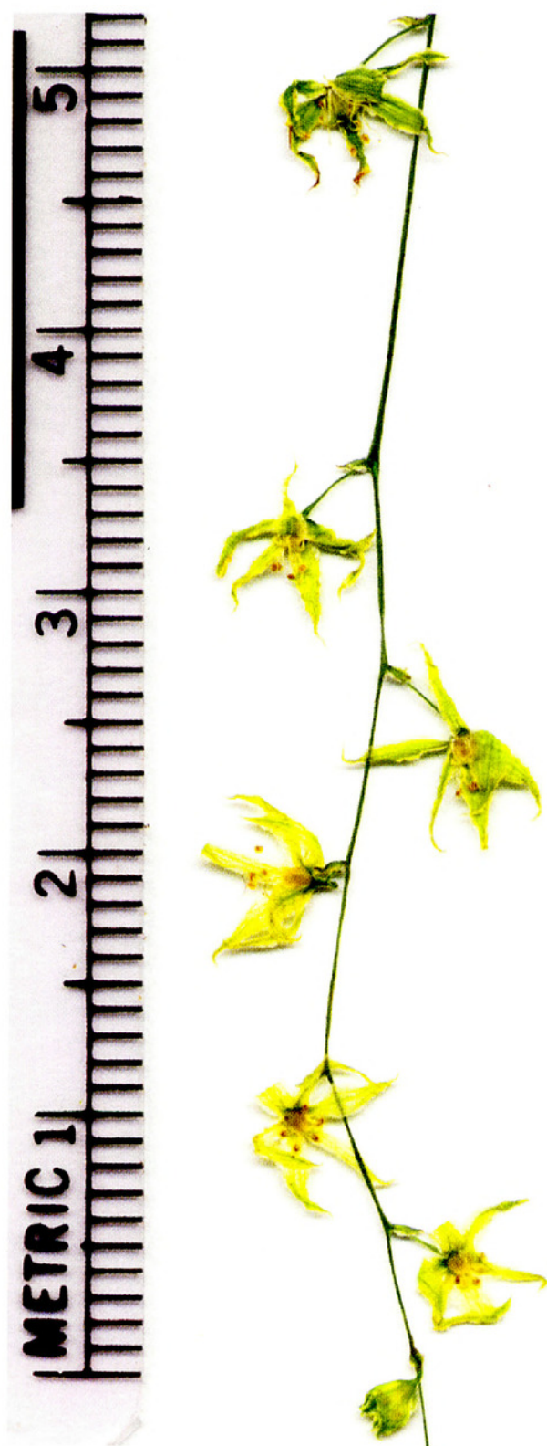
FIG. 4. Stenanthium diffusum , image of flowers at mid-portion of lateral inflorescence branch, from holotype.