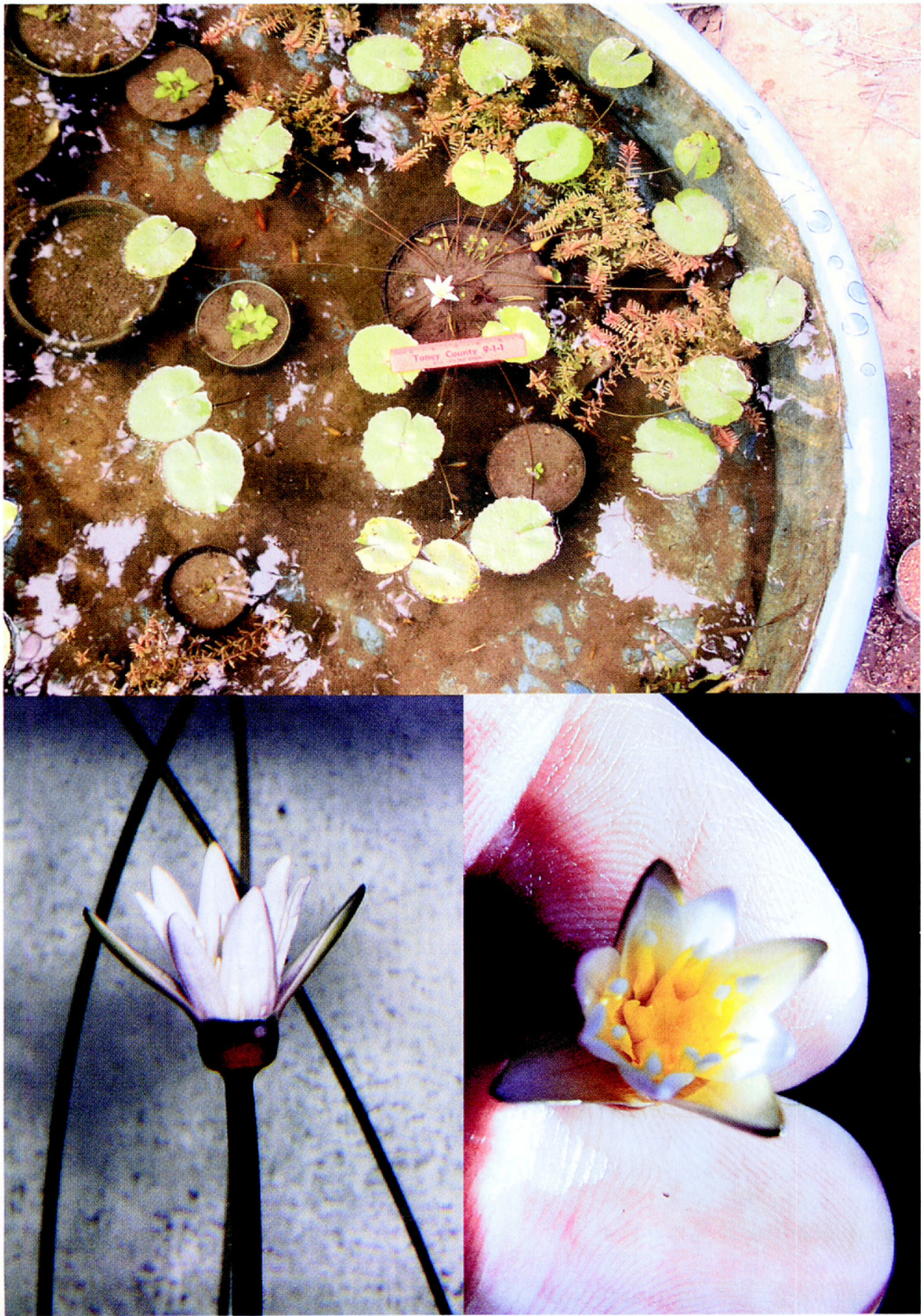
FIG. 4. Clockwise from top, mature Nymphaea minuta , emerged form with flower, ca. 60 cm wide; close up of flower showing stigmatic disk, carpellary styles and appendages on stamen; submerged flower fully open.