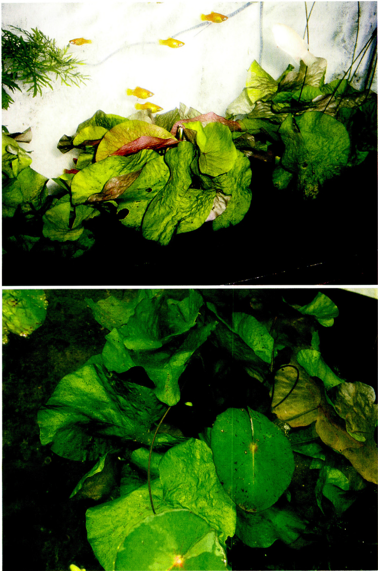
FIG. 3. Top, submerged plants under artificial light in an aquarium, not submerged bud on center plant. Bottom, submerged plant grown in pond under nature conditions in a tropical climate.