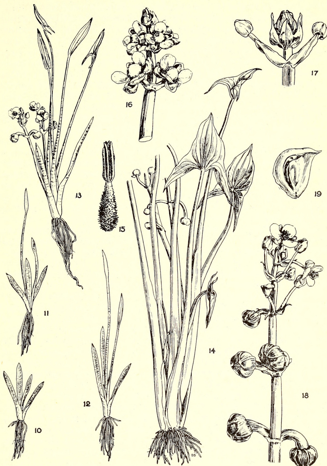
FIGS. 10-19. Sagittaria calycina Engelm.