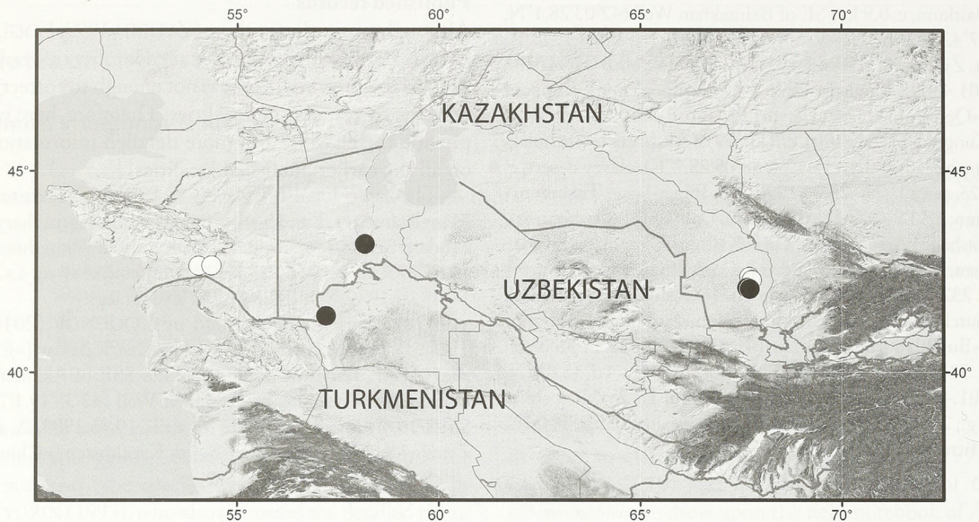
Fig. 6: Collection localities of Oculicosa supermirabilis Zyuzin, 1993. Closed dots – original data, open dots – literature-derived data.

kent, Shymkent] Area, Otrar Distr., Kyzylkum Desert, N foothills of Karaktau [=Kairaktau] Hills, c. 43.8 km NW of Bairkum, nr. Tabakbulak (42°21'26.7"N, 67°41'56.3"E), clayey soil, c. 225 m. a.s.l., 23–25.05.1993, A. A. Zyuzin leg. – (3) Kazakhstan, South Kazakhstan [=Chimkent, Shymkent] Area, Arys' Distr., Kyzylkum Desert, c. 35.2 km NW of Bairkum, Karaktau [=Kairaktau] Hills, Karamola Mt., top part (42°16'48.4"N, 67°45'28.7"E), c. 376 m. a.s.l., 29–31.05.1993, A. A. Zyuzin leg.