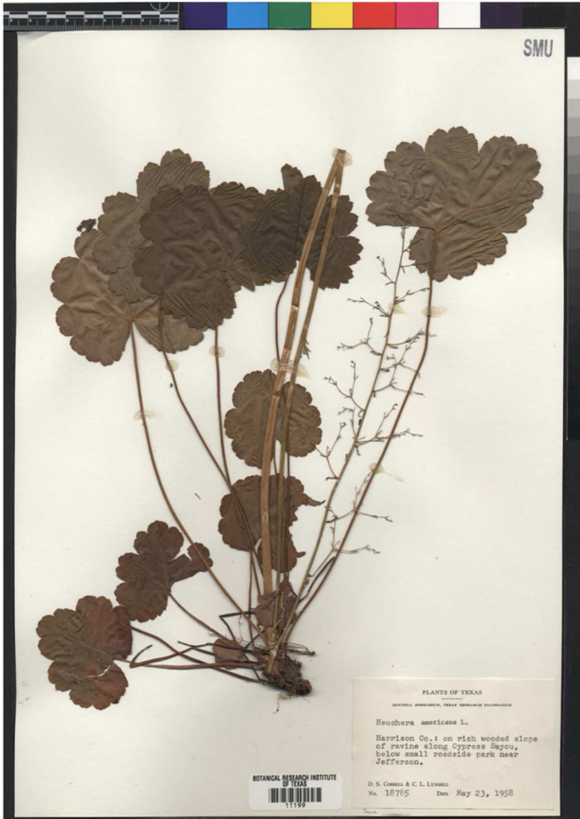
Figure 2. Correll & Lundell 18785 (SMU), from Harrison Co., Texas; the oldest Heuchera americana specimen from the state located during the study.