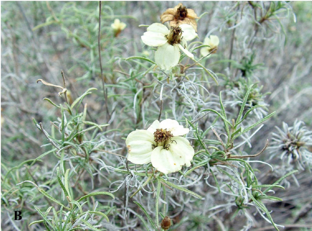
Figure 3a, b. Zinnia austrotexana at the type locality in Starr County, Texas.