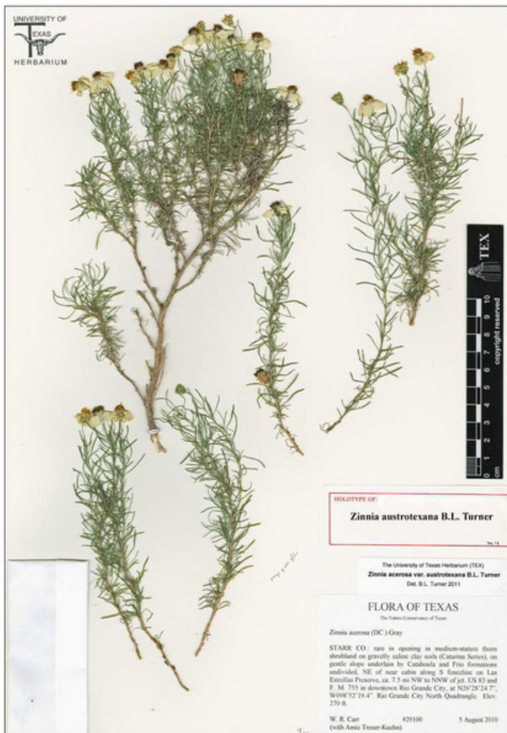
Figure 2. Zinnia austrotexana , holotype TEX.

In the fall of 2011, in company with Jana Kos, I revisited the two sites from which specimens of Zinnia austrotexana were gathered much earlier, but we were unable to relocate the taxon, perhaps due to the unusual drought conditions of that year but surely also to the considerable disturbances at the sites concerned. The Starr County location is now an assemblage of roadside houses.