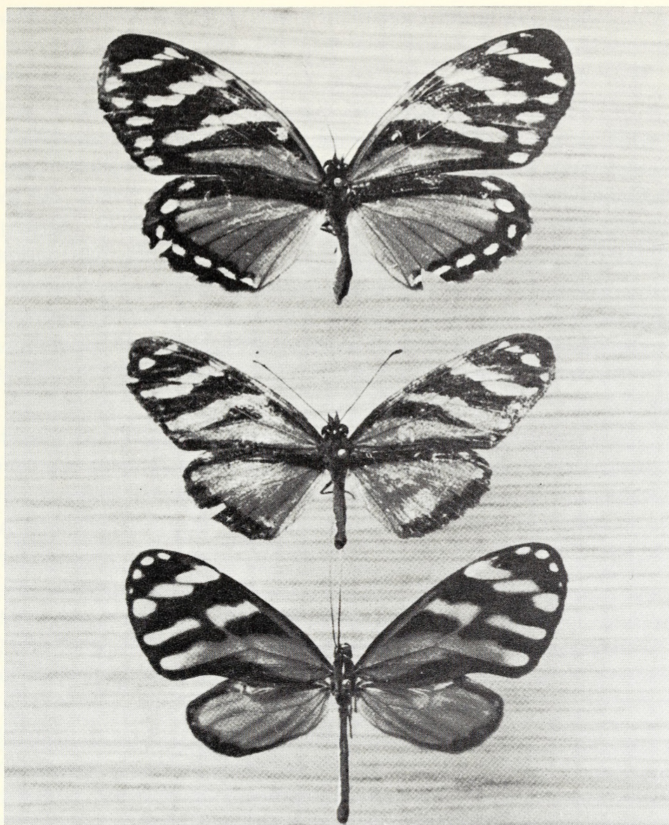
FIG. 4. Probable Batesian mimicry complex involving Phyciodes eutropia at Cuesta Angel. From top to bottom: Female P. eutropia , male P. eutropia , and male Ithomia heraldica ( Ithomiidae ). Dorsal aspects of all individuals are shown.

candidate for mimetic interaction is Ithomia heraldica heraldica (Fig. 4) in the Ithomiidae . This species feeds at the same flowers as P. eutropia and generally flies at the same time of day. In the absence of detailed quantitative data on the relative abundances of both species where they occur together and also on the possibly greater interaction of Ithomia with male P. eutropia , it is difficult to conclude that mimicry is operating between them.