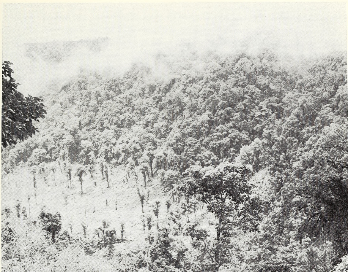
FIG. 1. Overall view of the forest ravine, Cuesta Angel, in the central highlands (Heredia Province) of Costa Rica.

of five days. Both adult habitat preferences and larval food plants were usually examined between 8:30 A.M. and 3:00 P.M., but the actual number of hours spent doing this daily was very irregular.