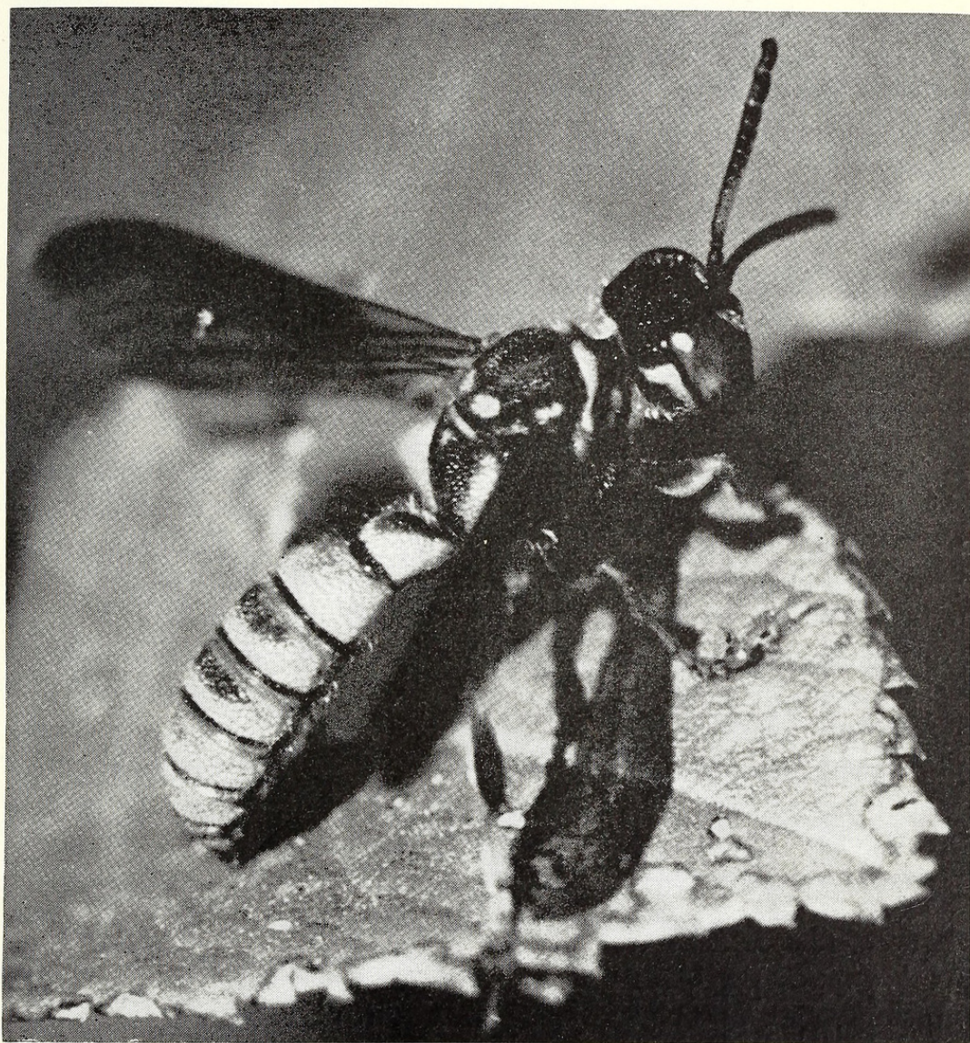
Fig. 2. A male Cerceris simplex perched on a rose leaf and resting between cruising flights about its home range.

In the late afternoon, especially before impending storms, males were seen flying slowly along the large rose bush. The wasps eventually alighted and walked under groups of tightly packed leaves and, in one case, into a tube formed by a rolled leaf, evidently in search of a sheltered sleeping site. One male ("red") that had been marked on the morning of 27 July at a spot 50 m to the south of the rose bush was found by this plant at 1610 seeking a resting place before a thunderstorm. The next morning it had returned to the area where it had been marked indicating that some males may fly modest distances from their home range in order to exploit a sleeping site.