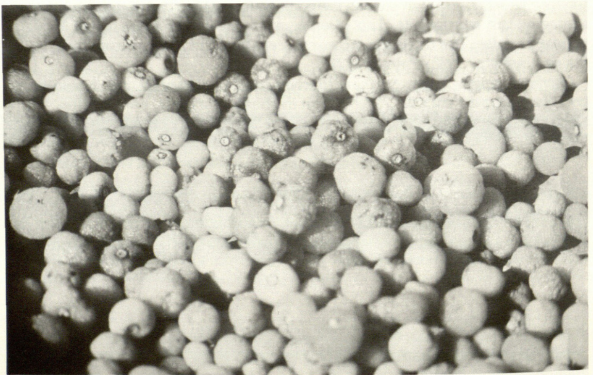
FIG. 4.—Fruits of madroño ( Arbutus xalapensis ).

Tonolochi ( Passiflora bryonioides H.B.K. and P. quercetorum Killip, Passifloraceae) is occasionally found on drier canyon walls and in protected locations in manzanilla thickets. The whitish fruits are occasionally eaten by children. Fruits of several species of Passiflora are widely utilized as food sources in many tropical countries (Martin and Nakasone 1970), orange fruits of palo del venado ( Lonicera cerviculata S.S. White, Caprifoliaceae) are considered edible but are not frequently eaten because of their relative rarity.