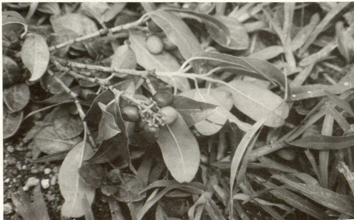
FIG. 2.—Fruiting branch of ahuasiqui blanco ( Prunus gentryi f. flavipulpa ).

are recognized, the purple-fruited ahuasiqui negro ( P. gentryi f. gentryi ) and the yellow-to-scarlet-colored ahuasiqui blanco ( P. gentryi f. flavipulpa ) (Fig. 2) (Laferrière 1989b). The latter is considered less astringent than the former. Capulín ( Prunus serotina var. virens ) (Fig. 3) is also present in similar habitats, but is underutilized because of its astringent taste. Parra ( Vitis arizonica Engelm.,