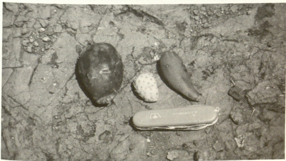
FIG. 1.—Fruits of (l-r) tuna temporal ( Opuntia cf. robusta ), duraznillo blanco ( O. durangensis ), and tuna de zorra ( O. cf. macrorhiza ).

The cladodes are especially important during the spring dry season since they are one of the first noncultivated resources to become available in the year. Cladodes of all six taxa are used in much the same manner. Nopal temporal is the most important, producing the largest cladodes and growing abundantly in virtually any nonplowed site. Tuna noviembreña is very similar, but has red rather than purple fruits which mature in October or November rather than August. Nopal de zorra is a small recumbent species producing narrow obconical fruits. The immature cladodes of both these species have an orange tint, especially toward the distal edge. Duraznillo is strikingly different in general appearance, being a darker shade of green and having smaller cladodes bearing shorter but more numerous spines while lacking the reddish tint. Nopal de Castilla is planted in a few kitchen gardens, and is valued for its large size and absence of spines.