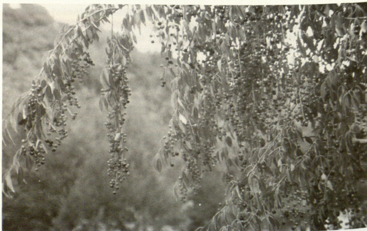
FIG. 3.—Fruiting branches of capulín ( Prunus serotina var. virens ).