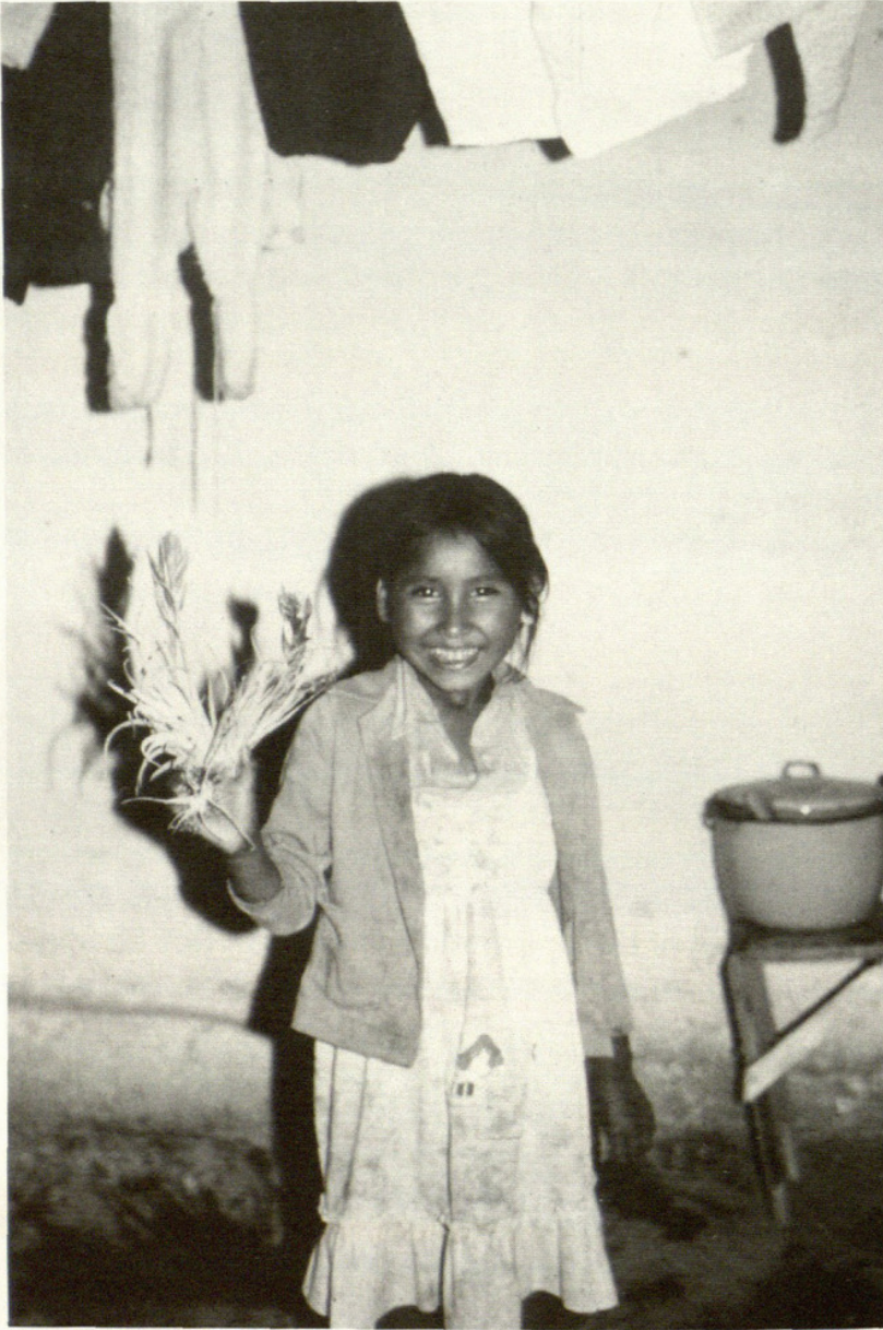
FIG. 8.—Flor de encino ( Tillandsia erubescens ).

wild plant species available in the early spring. The smaller T. recurvata L. is also present in the valley, but is less common. The two are ethnotaxonomically conspecific and are utilized in the same manner. Tillandsia has been widely used medicinally and as a source of packing material (Robinson 1947; Bennett and Zingg 1935; Laferrière 1991b), but we have been unable to locate any references to food uses for members of this genus. French and Abbott (1948) reported 1500 mg carotene and 46 mg ascorbate per 100 g fresh weight of shoot material of T. usneoides L.