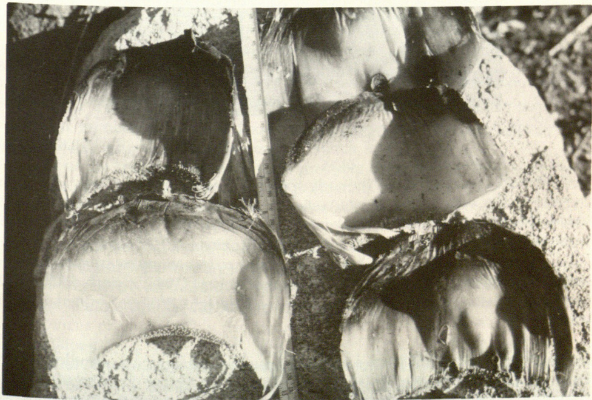
FIG. 7.—Roasted leaf bases of chugilla ( Agave shrevei ssp. matapensis ).

Epiphytes .—Inflorescences of the epiphytic bromeliad "flor de encino" ( Tillandsia erubescens Schlecht.) (Fig. 8) are occasionally eaten, and are reputed to be very sweet. The species flowers from March through May, and is thus one of the few