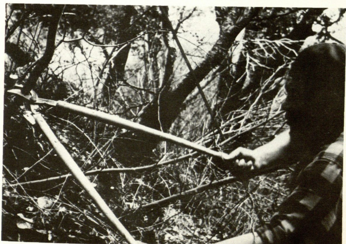
FIG. 2.—Coppicing redbud to induce rapid elongation of sprouts the following year.

characteristics most valued by the Southern Sierra Miwok and other California Indian peoples for basketry material (Fig. 3). Consistent, frequent pruning also keeps redbud shrubs of a smaller stature, with many slender boles that are easy to reach and cut, saving the basketweaver harvesting effort and time. In contrast, wild redbud has grey bark and twisted branches that are forked and often brittle; where the branches fork there is a notably more fragile area, making this section unsuitable for basketry.