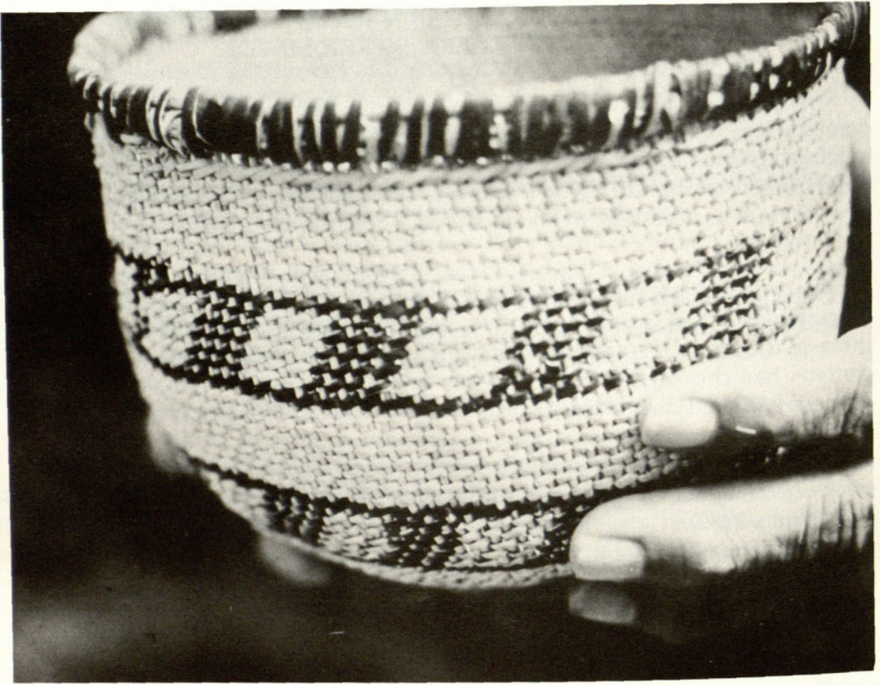
FIG. 1.—A Miwok coiled basket. The dark designs are made with split redbud bark.

most of the redbuds are mature and of tree size. The greatest number of immature redbuds are found along roadcuts. Furthermore, there are dying redbud shrubs under oak canopies. The shrub is not very shade tolerant and is outcompeted in such situations, by other species (Stewart Winchester, pers. comm. 1988). 5 Perhaps the current status of redbud reflects the absence of intense fires due to fire exclusion practices by public lands agencies, and the lack of Indian management of redbud at these sites.