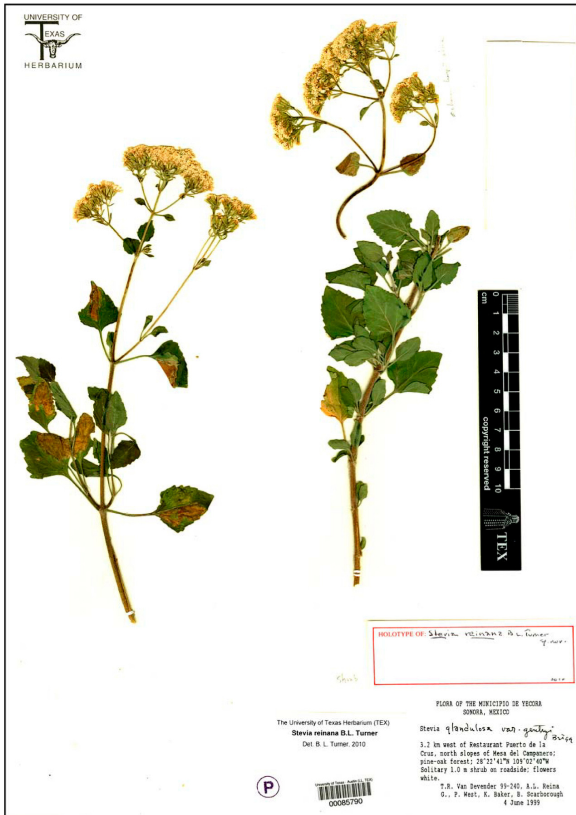
Fig. 1. Stevia reinana (holotype).