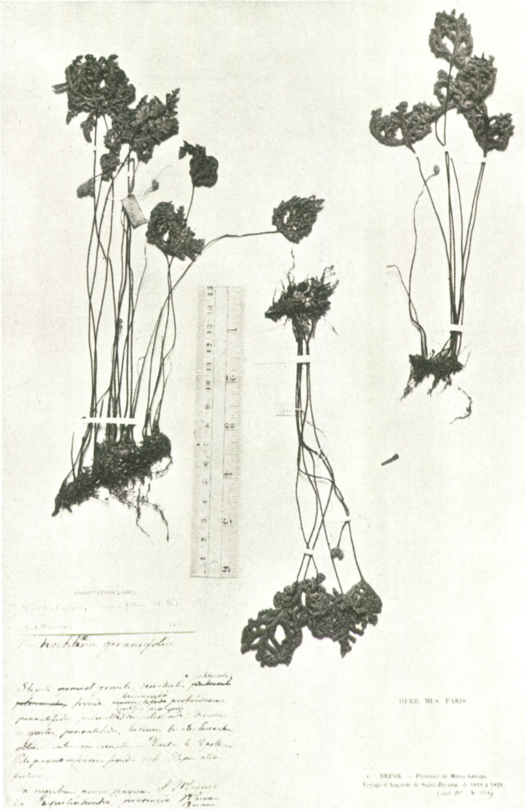
“NOTHOLAENA” IN BRAZIL