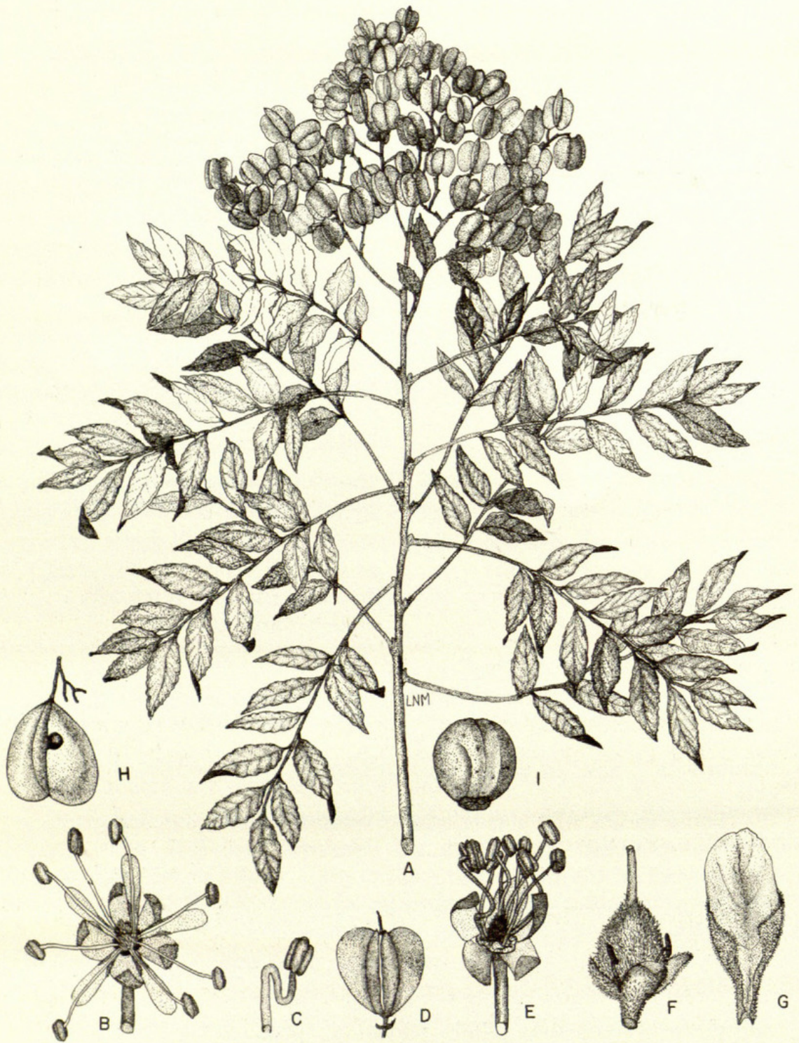
FIGURE 1. Sinoradlkofera minor : a, habit of the plant, \times \frac{1}{4} , from (Wang) Sun Yatsen University 41208; b, staminate flower, \times 3 ; c, geniculate stamen, \times 5 ; d, inflated retuse capsule showing persistent calyx, \times \frac{3}{4} ; e, staminate flower (petals missing), showing calyx, disc, pistil, and stamens at anthesis, \times 3 ; f, pistillate flower (petals missing), showing aborted stamens, \times 4 ; g, petal, \times 8 (b-g from (Wang) Sun Yatsen University 40934); h, capsule with exposed seed, \times \frac{3}{4} (after Hooker's Ic. Pl. XXVII: pl. 2642; i, strophiolate seed, \times 3 (Tsang 28000)).