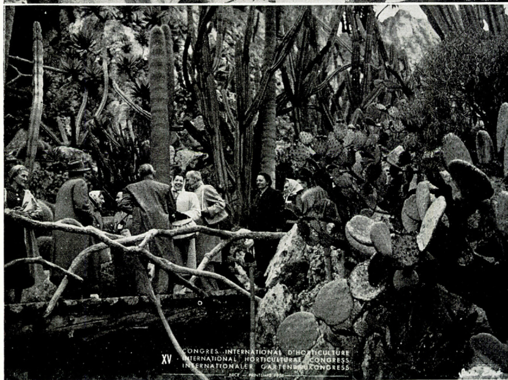
Above: A group of the participants at a plenary session of the XVI International Horticultural Congress held in Nice, France.