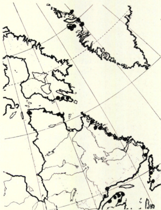
MAP 3. American Range of ARABIS ALPINA .

erect or ascending, nerveless or nearly so or if one-nerved then only at the extreme base and very faintly so; fruiting pedicels ascending, glabrous, 7–15 mm. long at maturity; stigma small, flat-topped to subcupulate, on a short stocky style 0.25–0.75 mm. long; seeds in one row, orbicular to subquadrate, averaging 1.25 mm. in diameter, narrowly winged all around, the wing averaging 0.25 mm. broad.—Sp. Pl. ii. 664 (1753); Oeder in Fl. Dan. t. 62 (1766); Scopoli, Fl. Carn. ed. ii. 29 (1772); Lam. Encyl. i. 218 (1783); Curtis in Bot. Mag. vii. t. 226 (1793); Persoon, Synop. Pl. ii. 204 (1807); Poir. Suppl. Encyl. i. 410 (1810); Pursh, Fl. Am. Sept. ii. 438 (1814); Hartman, Handbk. Scand. Fl. 225 (1820); DC. Syst. ii. 216 (1821) and Prod. i. 142 (1824); Hooker, Fl. Bor.-Am. i. 41 (1829); E. Meyer, Pl. Labr. 84 (1830); Schlecht., Fl. Labr. in Linnaea x. 102 (1836); T. & G. Fl. N. Am. i. 80 (1838); Ledebour, Fl. Ross. i. 117 (1842); Walpers, Rep. i. 130 (1842); Dietrich, Synop. iii. 689 (1843); Bennett, Fl. Alps i. 18 (1846); Godet, Fl. Jura 36 (1853); Bouvier, Fl. Suisse 40 (1878) and Fl. Alps 10 (1882); Gaudin, Synop. Fl. Helv. 550 (1886); Wats. in Gray, Synop. Fl. N. Am. i. 163 (1895); Britton & Brown, Ill. Fl. ii. 147 (1897); Britton Man. Fl. ed. 2: 464 (1905); Porsild, Fl. Disko, Greenland 83 (1926). Turritis verna Lam. Fl. Fr. ii. 490 (1778). Arabis incana Moench, Meth.