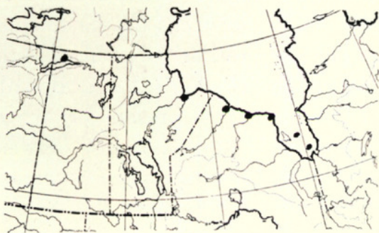
MAP 2. Range of ARABIS ARENICOLA , var. PUBESCENS .

Var. PUBESCENS (S. Wats.) Gelert. Base of stem and radical leaves pubescent with simple and bifurcate hairs.— Bot. Tidssk. xxi. 290 (1898). A. humifusa (J. Vahl) S. Wats. var. pubescens S. Wats. in Gray, Synop. Fl. N. Am. i. 160 (1895).—West coast of Hudson Bay from lat. 52^{\circ} to 57^{\circ} N. , also