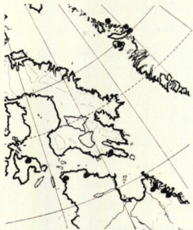
MAP 1. Range of ARABIS ARENICOLA .

Tartusaq Hus, 71^{\circ} 22' N. , Porsild & Porsild , 20 July 1929; Umiarfik Fjord, Vestside, udenfor anden Indsnoeing, lat. 72^{\circ} 8' N. , M. P. Porsild , 8 Aug. 1934. CANADIAN ARCTIC ARCHIPELAGO: Baffin Island, Lake Harbor, lat. 62^{\circ} 49' , Malte , no. 118,878; Southampton Island, lat. 64^{\circ} 10' , Malte , no. 120,652. UNGAVA: Wolstenholm, Hudson Strait, lat. 62^{\circ} 40' , Malte , no. 120,929; Port Harrison, east coast of Hudson Bay, lat. 58^{\circ} 17' , Malte , nos. 120,786 & 120,826. LABRADOR: spur on southwest side, Mt. Tetragona, Torn-gat Region, Abbe , no. 390; easterly slope of Bishop's Mitre, Kaumejet Mts., Abbe , no. 391. Fl. June–July; fr. July–Aug. MAP 1.