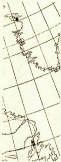
MAP 4. Range of ARABIS ALPINA, var. GLABRATA (Greenl.) and of A. ALPINA, forma PHYL- LOPETALA (Nfld.)