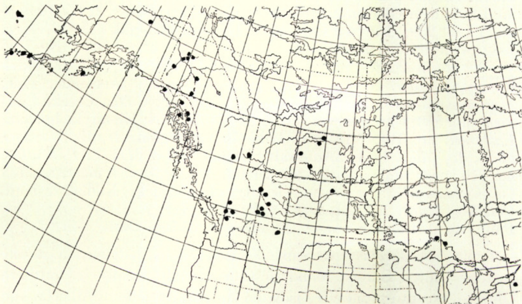
MAP 7. Range of ARABIS LYRATA , var. GLABRA .

Var. glabra (DC.) comb nov. Biennial or rarely perennial; stem and radical leaves quite glabrous or very rarely the petioles sparingly hirsute with a few scattered and simple hairs; style not exceeding 0.75 (–1) mm. long.— A. ambigua var. glabra DC. Syst. ii. 231 (1821); DC.