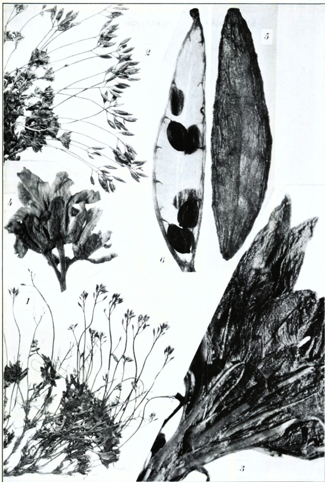
DRABA ALLENII, n. sp.: FIG. 1, portion of flowering plant, \times 1 ; FIG. 2, portion of fruiting plant, \times 1 ; FIG. 3, leaves, \times 10 ; FIG. 4, flowers, \times 10 ; FIGS. 5 and 6, valve and septum, \times 10 ; all from Shickshock Mts., Quebec.