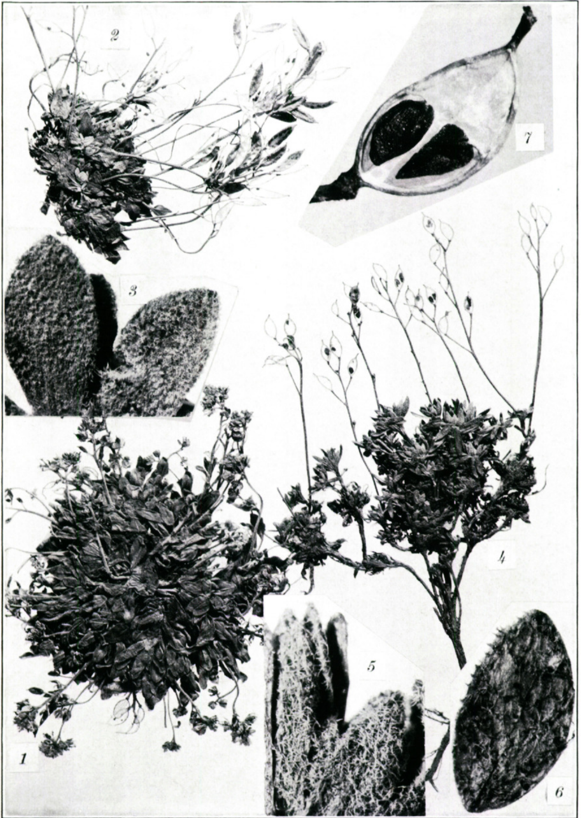
DRABA NIVALIS: FIG. 1, flowering plant, \times 1 , from Greenland; FIG. 2, fruiting plant, \times 1 , from Greenland; FIG. 3, leaves, \times 10 , from Newfoundland.