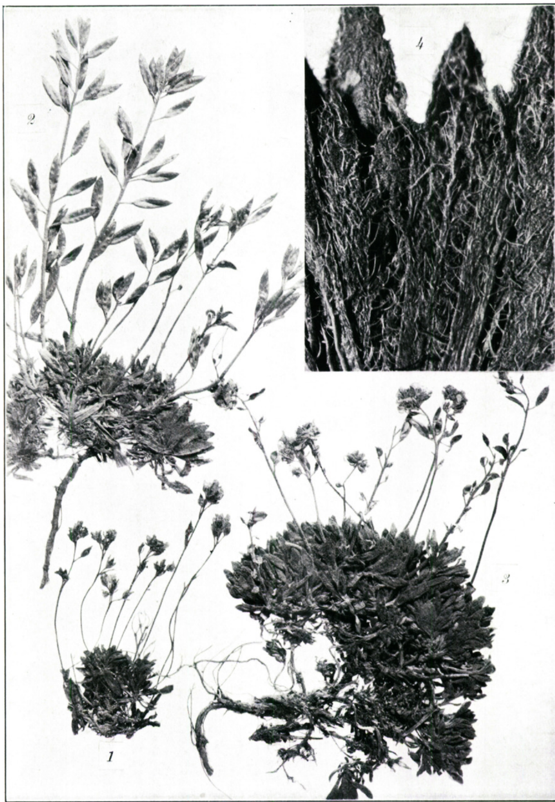
DRABA RUPESTRIS: FIG. 1, small flowering plant, \times 1 , from type locality, Ben Lawers, Scotland; FIG. 2, fruiting plant, \times 1 , from Newfoundland; FIG. 3, flowering plant, \times 1 , from Labrador; FIG. 4, leaves, \times 10 , from fig. 2.