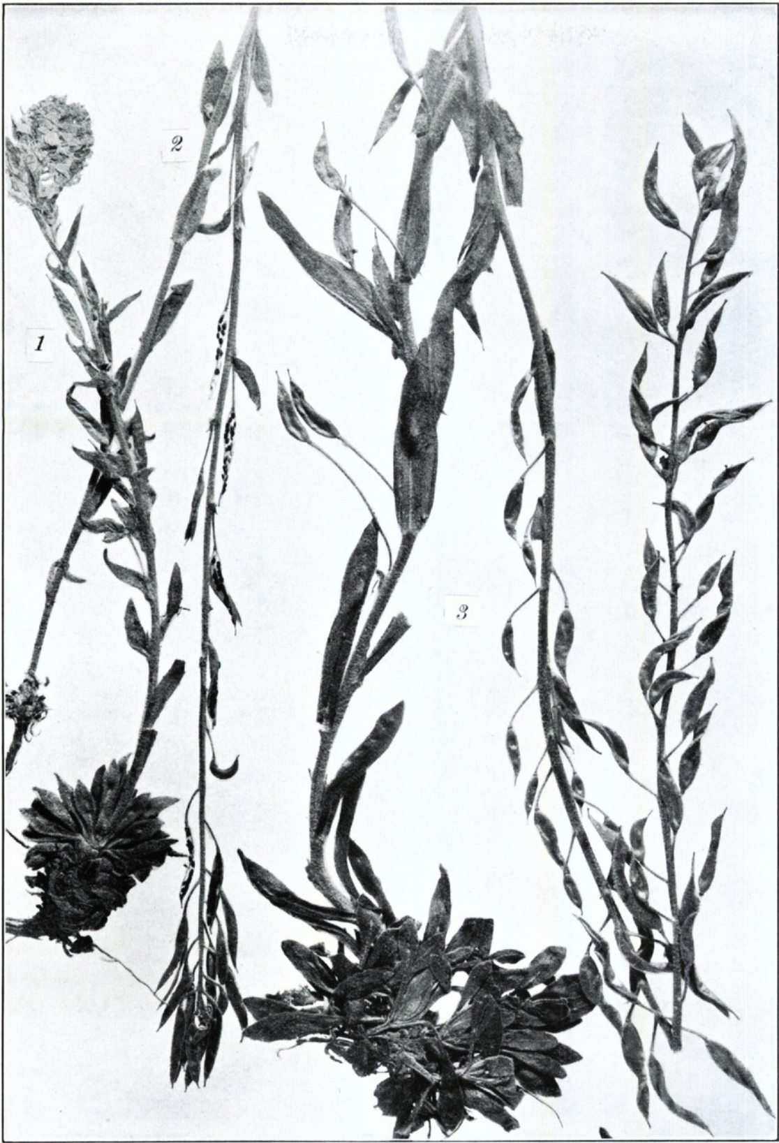
DRABA AUREA: FIG. 1, small flowering plant, \times 1 , from Greenland; FIG. 2, small fruiting plant, \times 1 , from Greenland; FIG. 3, fruiting plant, \times 1 , from Alberta.