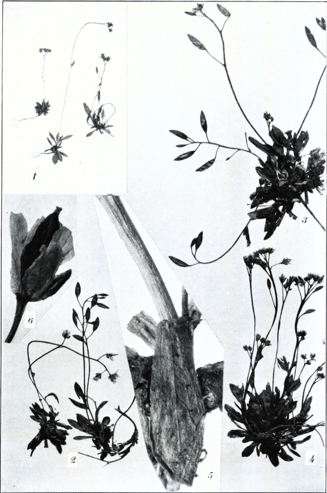
DRABA CRASSIFOLIA: FIG. 1, small flowering plants, \times 1 , from original collection of Drummond; FIG. 2, flowering and fruiting plants from Labrador; FIGS. 3 and 4, fruiting and flowering plants from Greenland, \times 1 ; FIG. 5, leaf and base of scape, \times 10 , from fig. 2; FIG. 6, flower, \times 10 , from fig. 4.