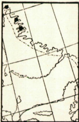
Map 5. Southeastern Extension in America of DRABA CRASSIFOLIA .

(rarely -22) mm. long: sepals oblong or oblong-elliptic, 1.5-2.3 mm. long: petals yellow, drying whitish, rarely white from the first, often