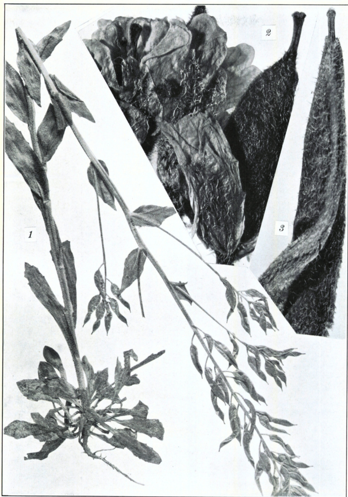
DRABA MINGANENSIS: FIG. 1, well developed fruiting plant, \times 1 , from Bic, Quebec; FIGS. 2 and 3, flowers and tip of silique, \times 10 , from Bic.