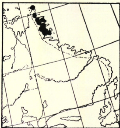
Map 2. Southeastern Extension in America of DRABA FLADNIZENSIS , var. HETEROTRICHA .

West Summit of Bishop's Mitre, Abbe, no. 387. UNGAVA: Port