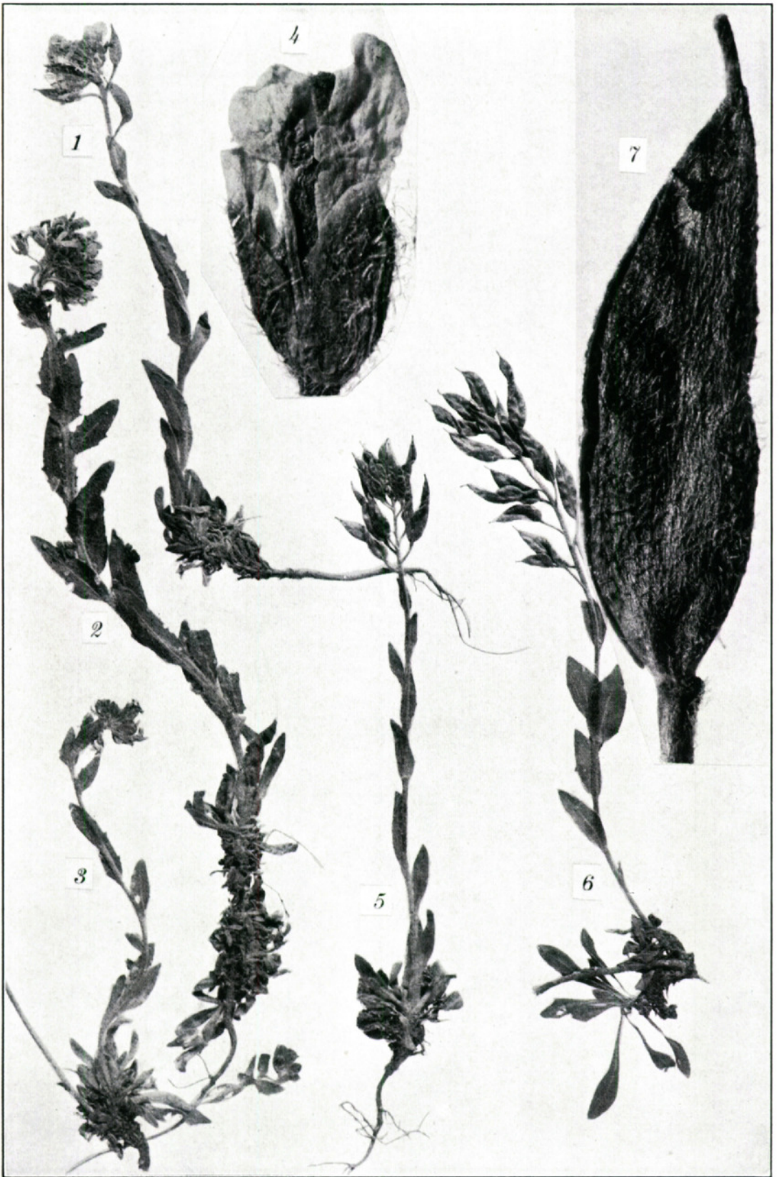
DRABA MINGANENSIS , n. sp.: FIGS. 1, 2 and 3, small flowering plants, \times 1 , from Archipel de Mingan, Quebec (isotypes of D. luteola , var. minganensis ); FIG. 4, flower, \times 10 , from fig. 1; FIG. 5, small fruiting plant, \times 1 , from Bic, Quebec.