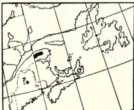
Map 3. Range of DRABA ALLENI .