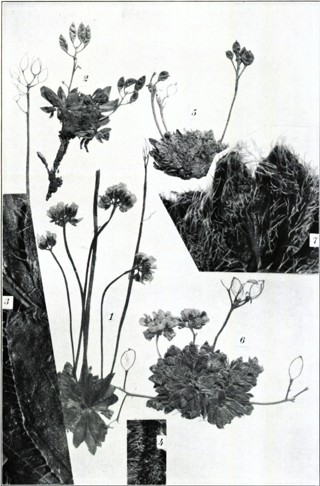
DRABA ALPINA: FIG. 1, flowering plant, \times 1 , from Norway; FIG. 2, small fruiting plant, \times 1 , from Torne Lappmark; FIG. 3, portion of rosette, \times 10 , from fig. 2; FIG. 4, summit of scape, \times 10 , from fig. 2. D. ALPINA, var. NANA: FIG. 5, fruiting plant, \times 1 , from Mansfield Island, Hudson Bay (isotype of D. Bellii ); FIG. 6, flowering plant, \times 1 , from Thule, northwest Greenland; FIG. 7, leaves, \times 10 , from fig. 6.