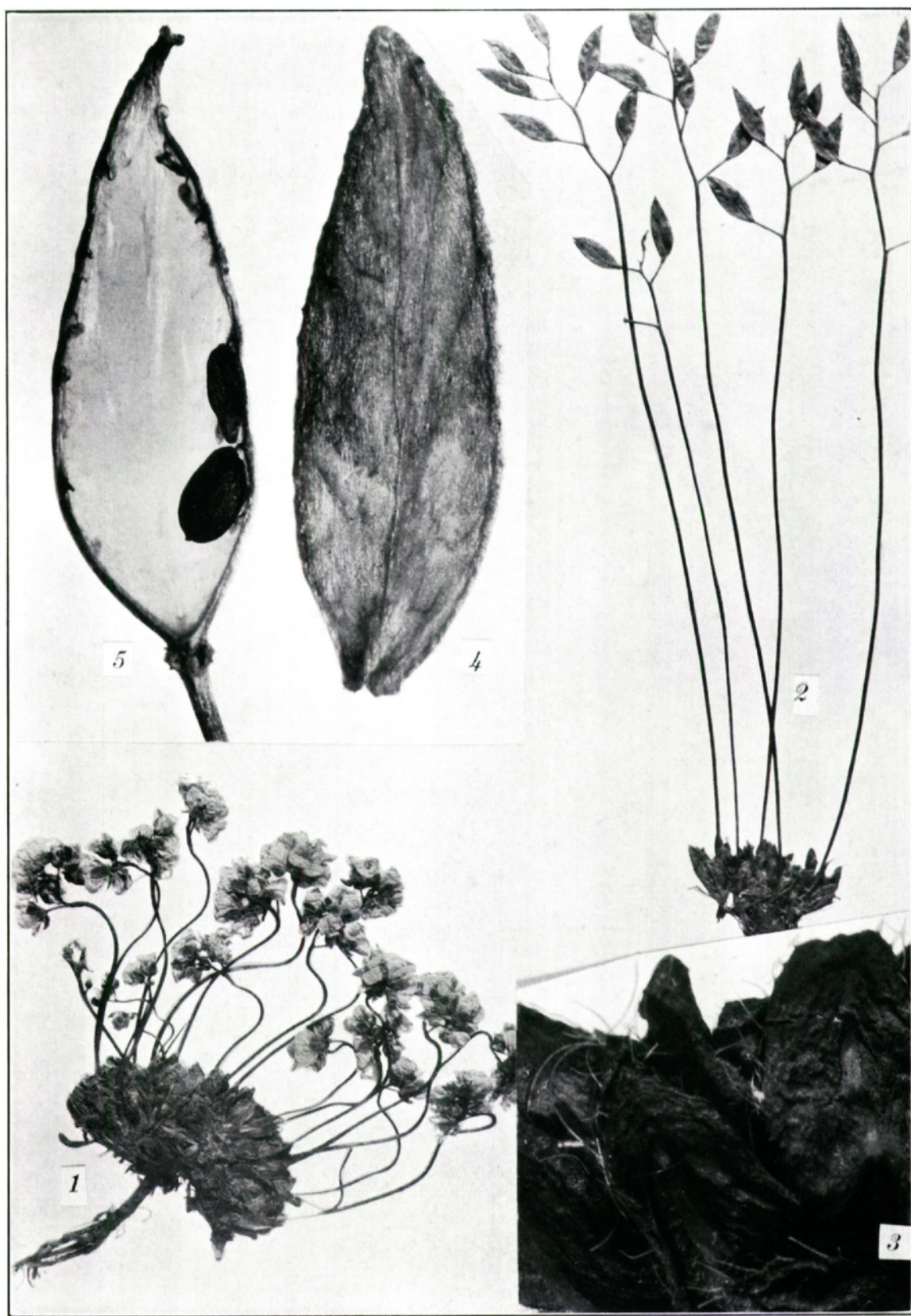
DRABA FLADNIZENSIS, var. HETEROTRICHIA: FIG. 1, small flowering plant, \times 1 , from Thule, northwest Greenland; FIG. 2, fruiting plant, \times 1 , from Labrador; FIG. 3, tips of leaves, \times 10 , from fig. 1; FIGS. 4 and 5, valve and septum, \times 10 , from Torne Lappmark.