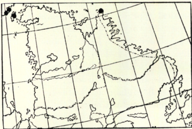
Map 1. Range in eastern America of ARNICA ALPINA .