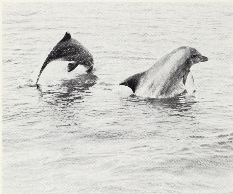
Fig. 2. Two Indian Ocean bottlenose dolphins ( Tursiops aduncus ) surface simultaneously at speed. The dolphins on the left is completing a „long-jump“, seen characteristically during fish herding procedures, or when a group of dolphins is progressing rapidly in transit from one area to another.

When counts without photographic aids are made, subgroups of two or more dolphins, surfacing simultaneously (see fig. 2), are readily identifiable. However, dolphins surfacing individually at widely separated points may be mistaken for lone individuals: this photographic technique has frequently