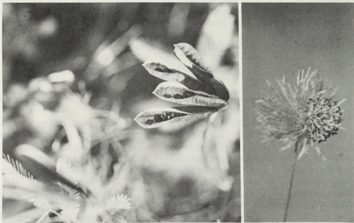
Plate 1. Neptunea plena (L.) Bth. Mature pods and seeds; insert: mature inflorescence with staminodes, and staminate and bisexual flowers.